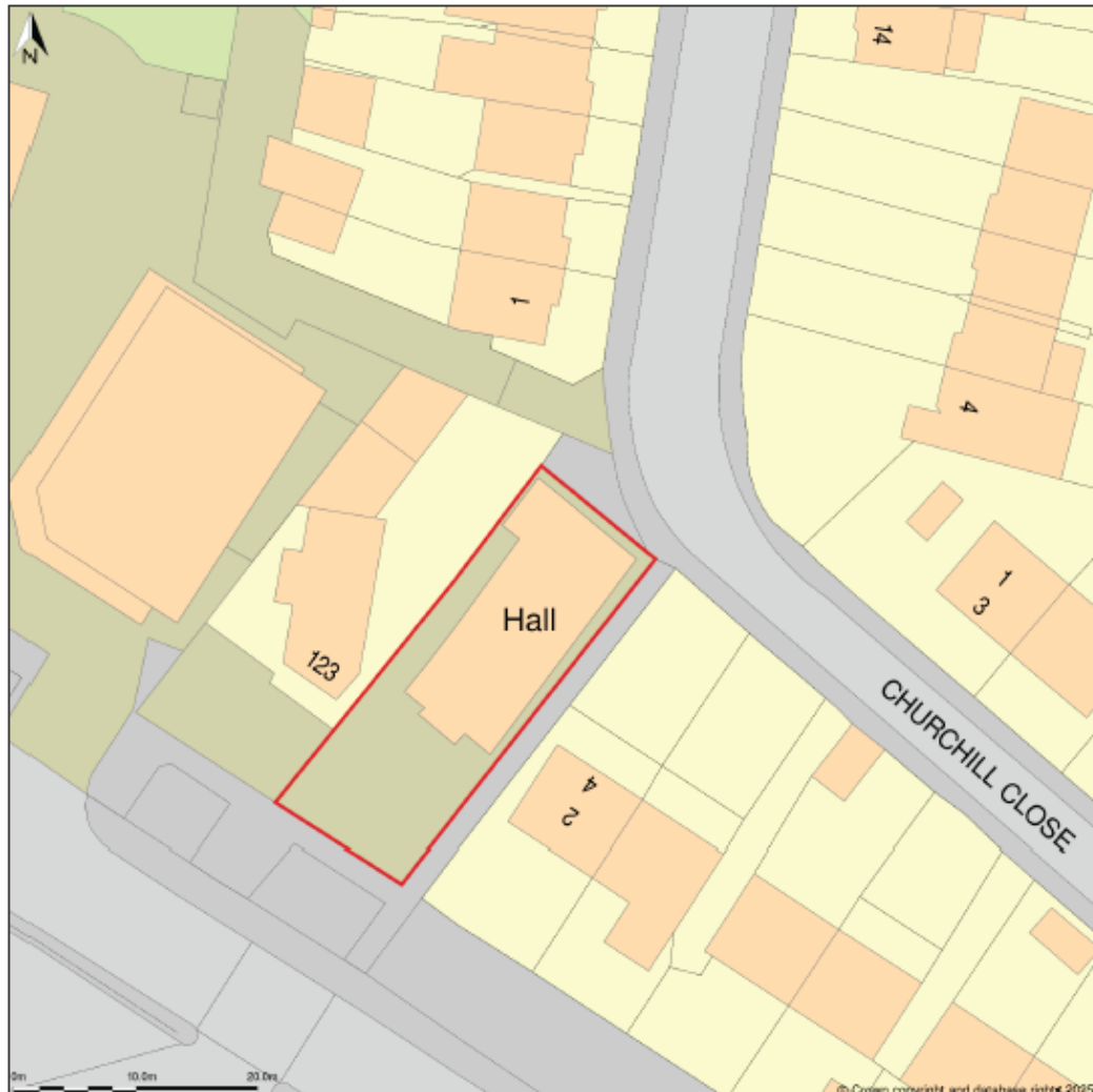
Image 2. Extract from Ordnance Survey showing the site marked in red

The Salvation Army, 125, Uxbridge Road, Uxbridge, Hillingdon, UB10 0LQ