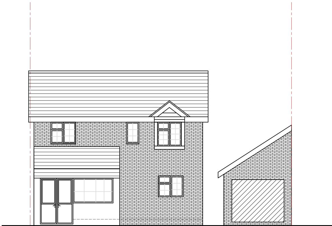
Existing Front Elevation Scale:1:100