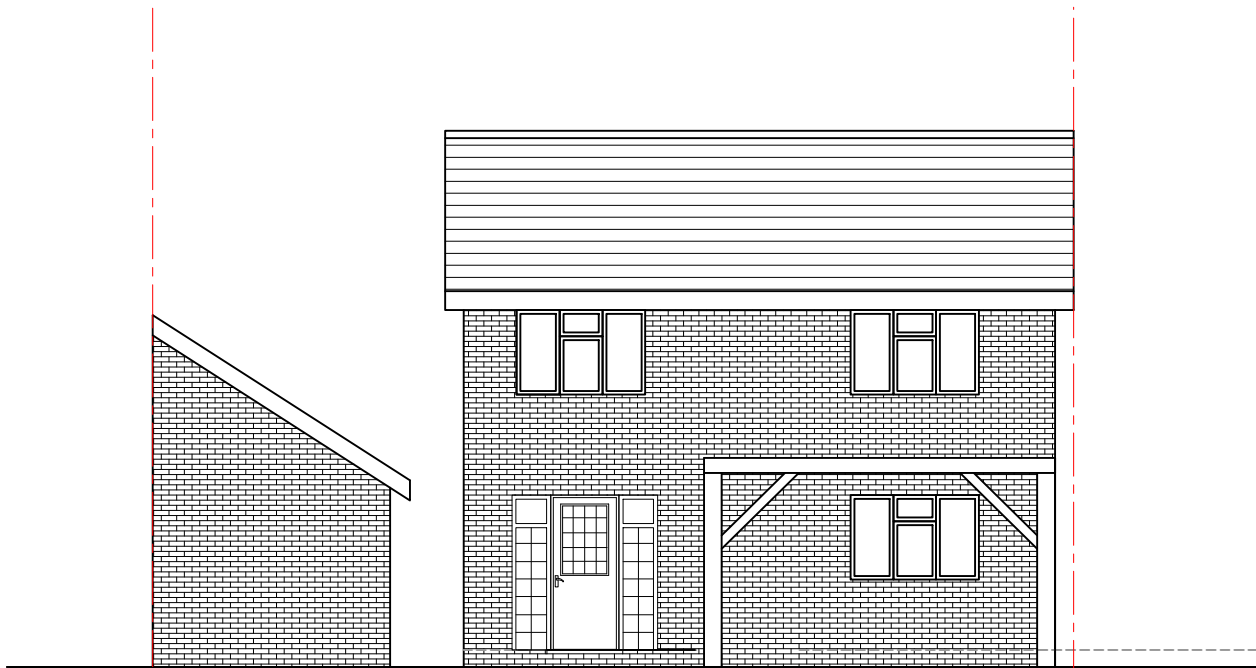
Existing Rear Elevation Scale:1:100