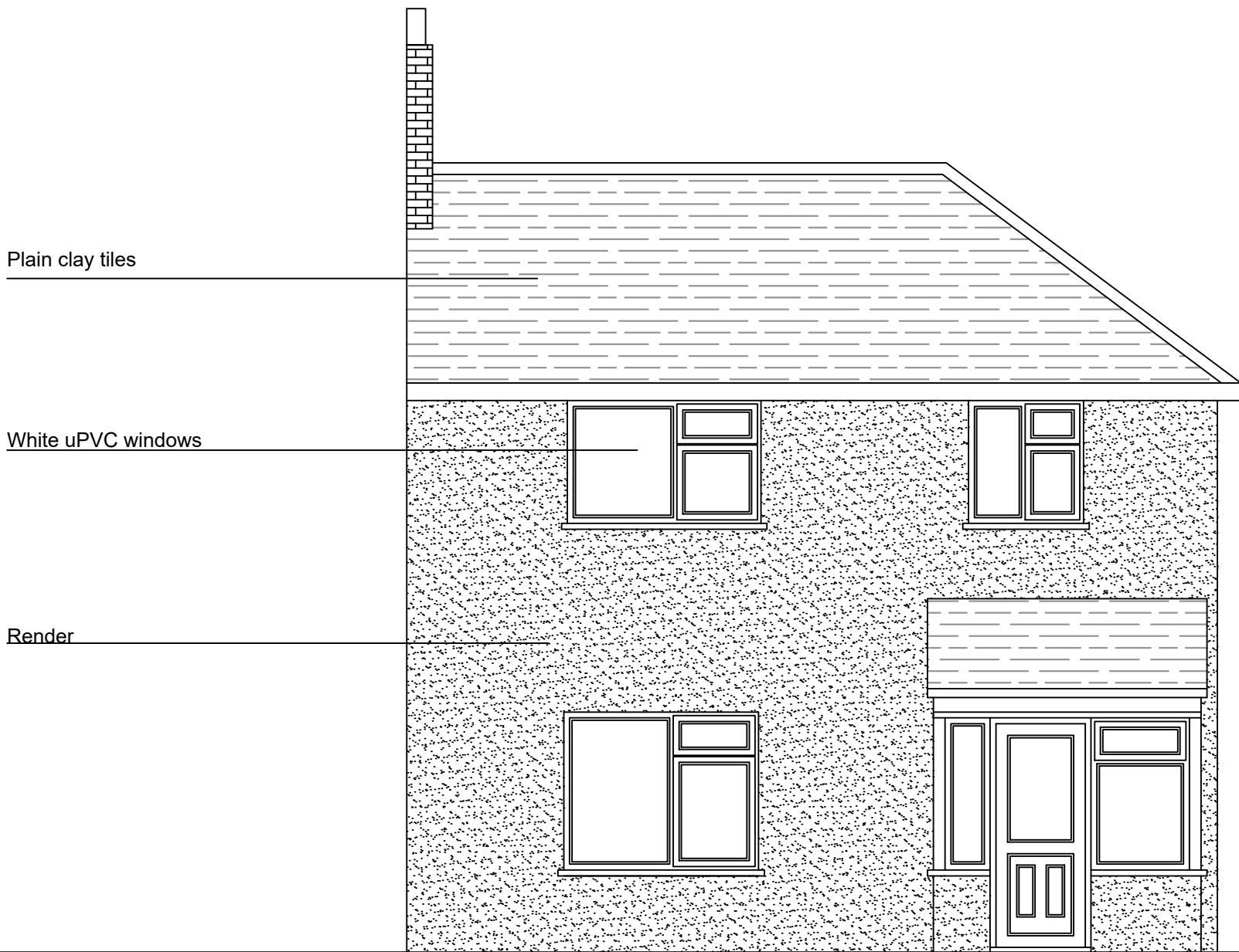
EXISTING FRONT ELEVATION A