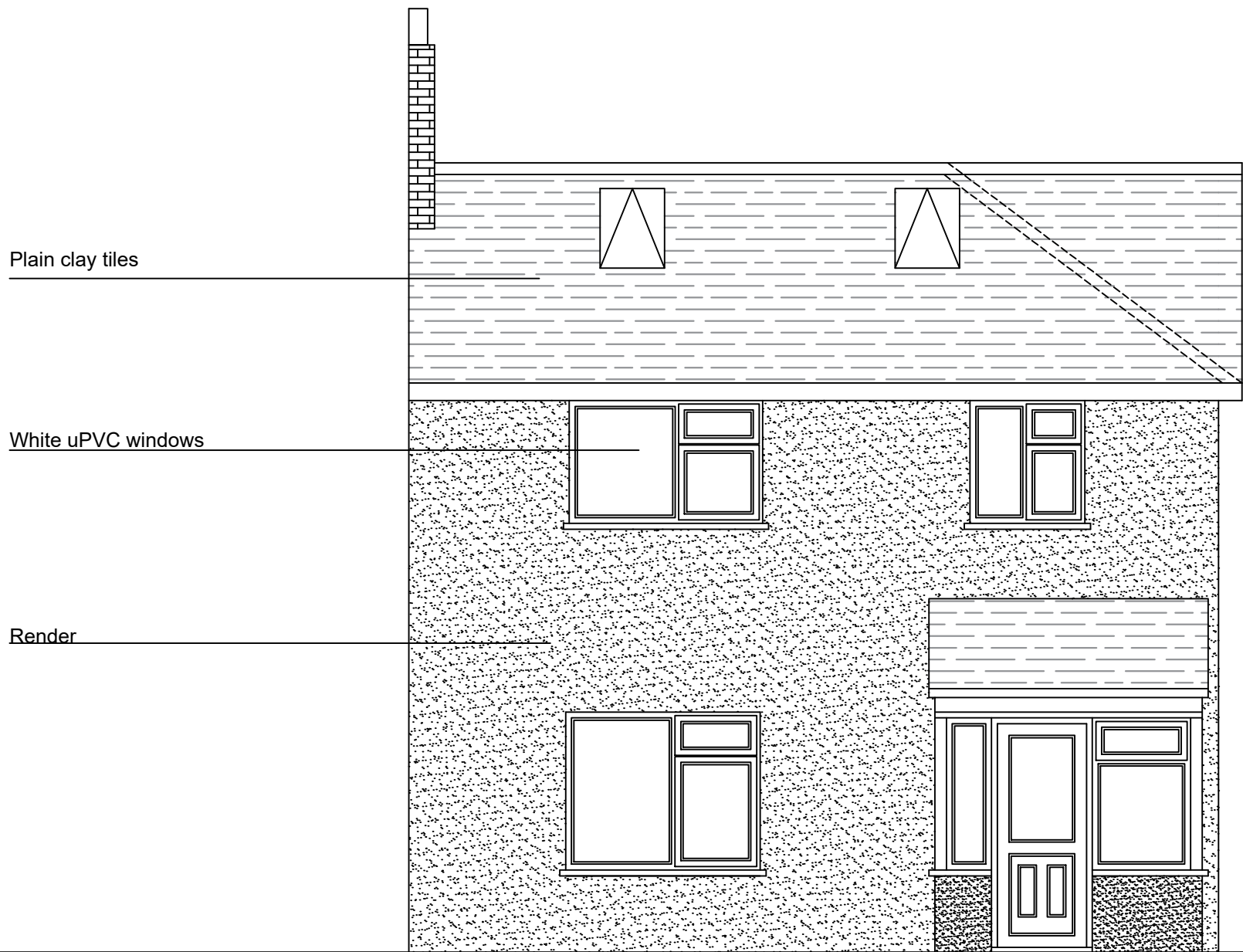
PROPOSED FRONT ELEVATION A