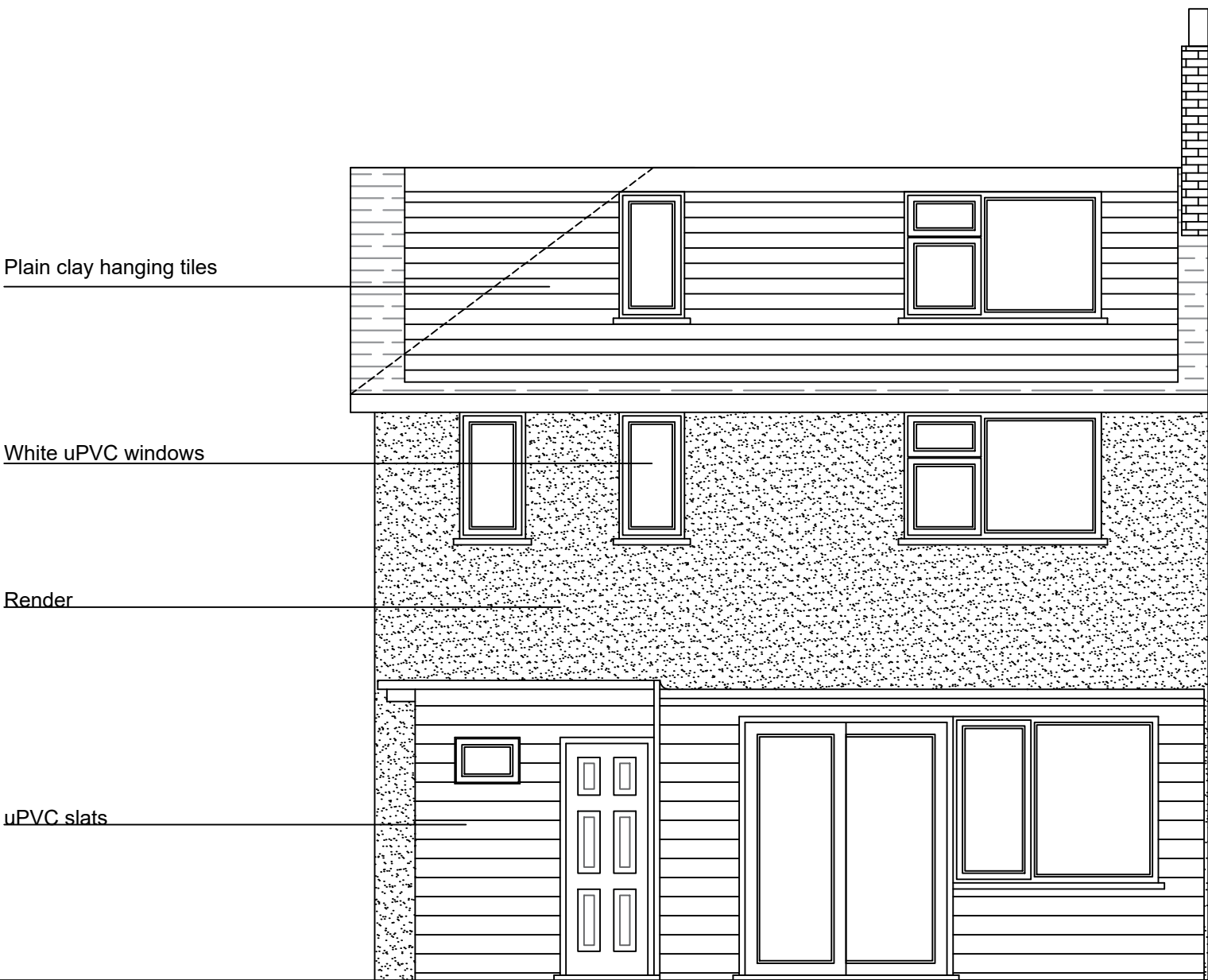
PROPOSED REAR ELEVATION C