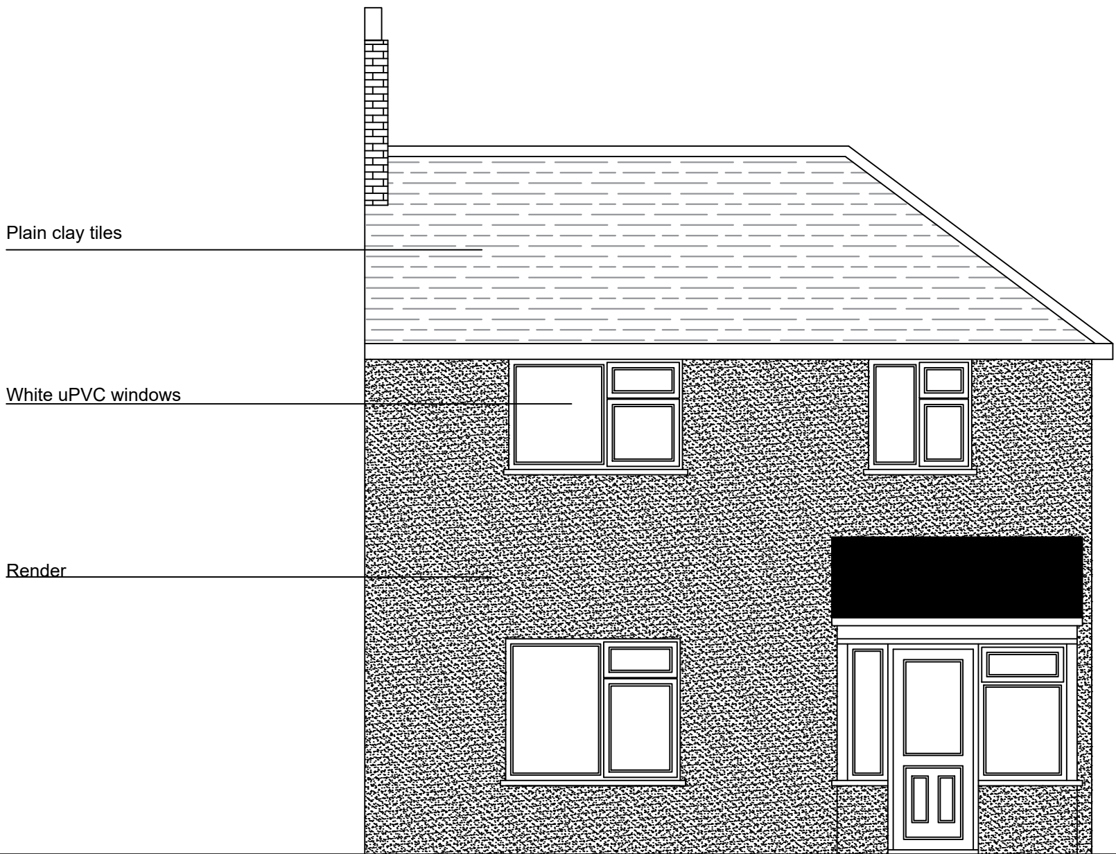
EXISTING FRONT ELEVATION A