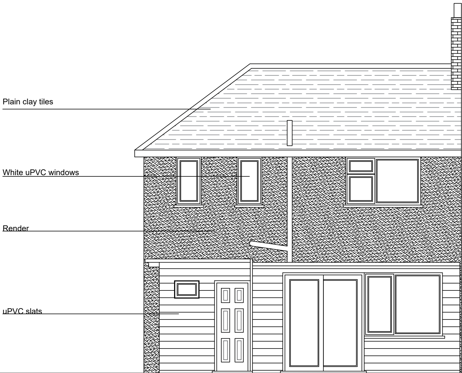
EXISTING REAR ELEVATION C