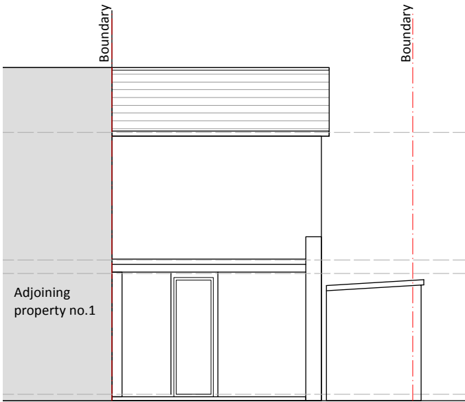
1 South East Scale: 1:100