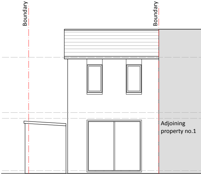
2 North West Scale: 1:100