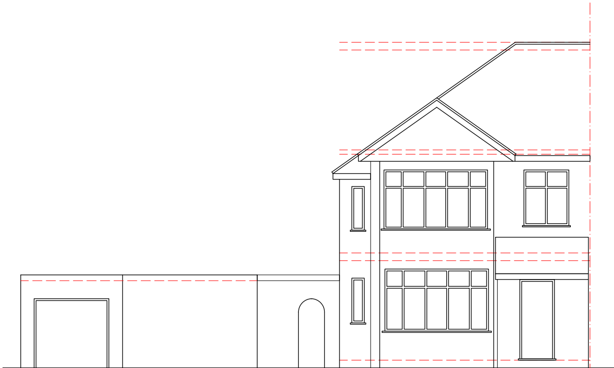
1 WEST - Front