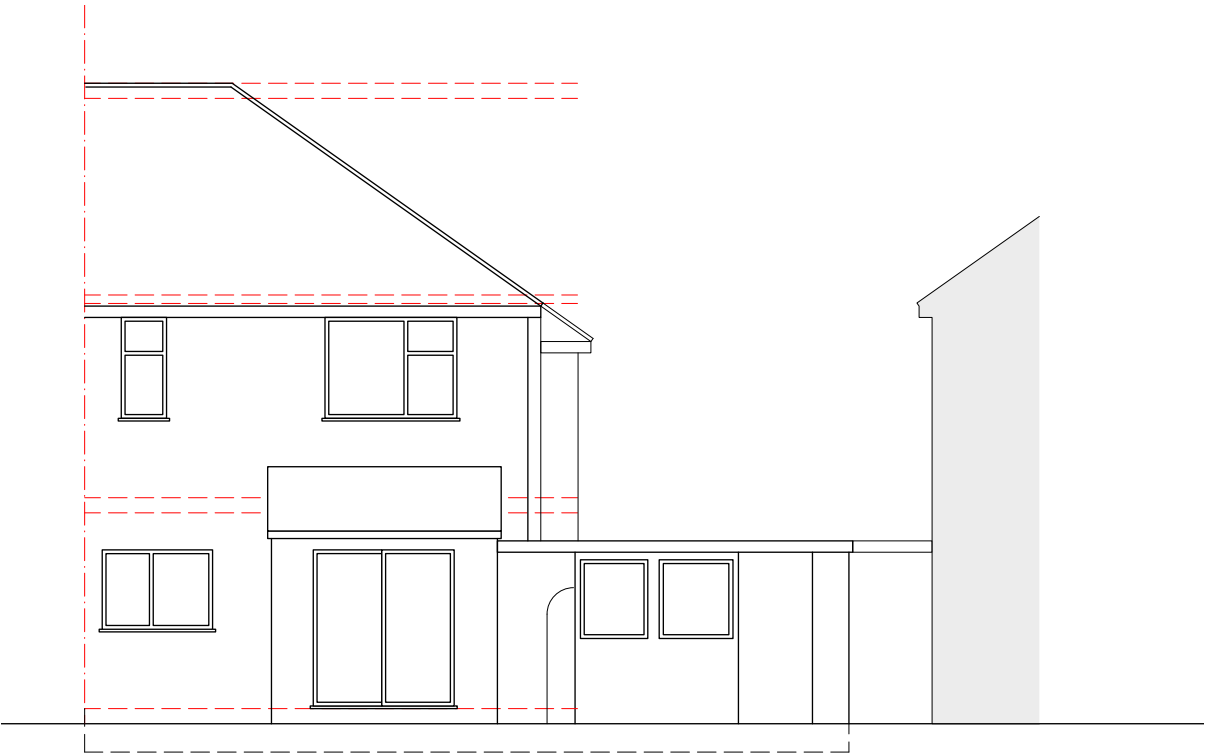
3 EAST - Rear