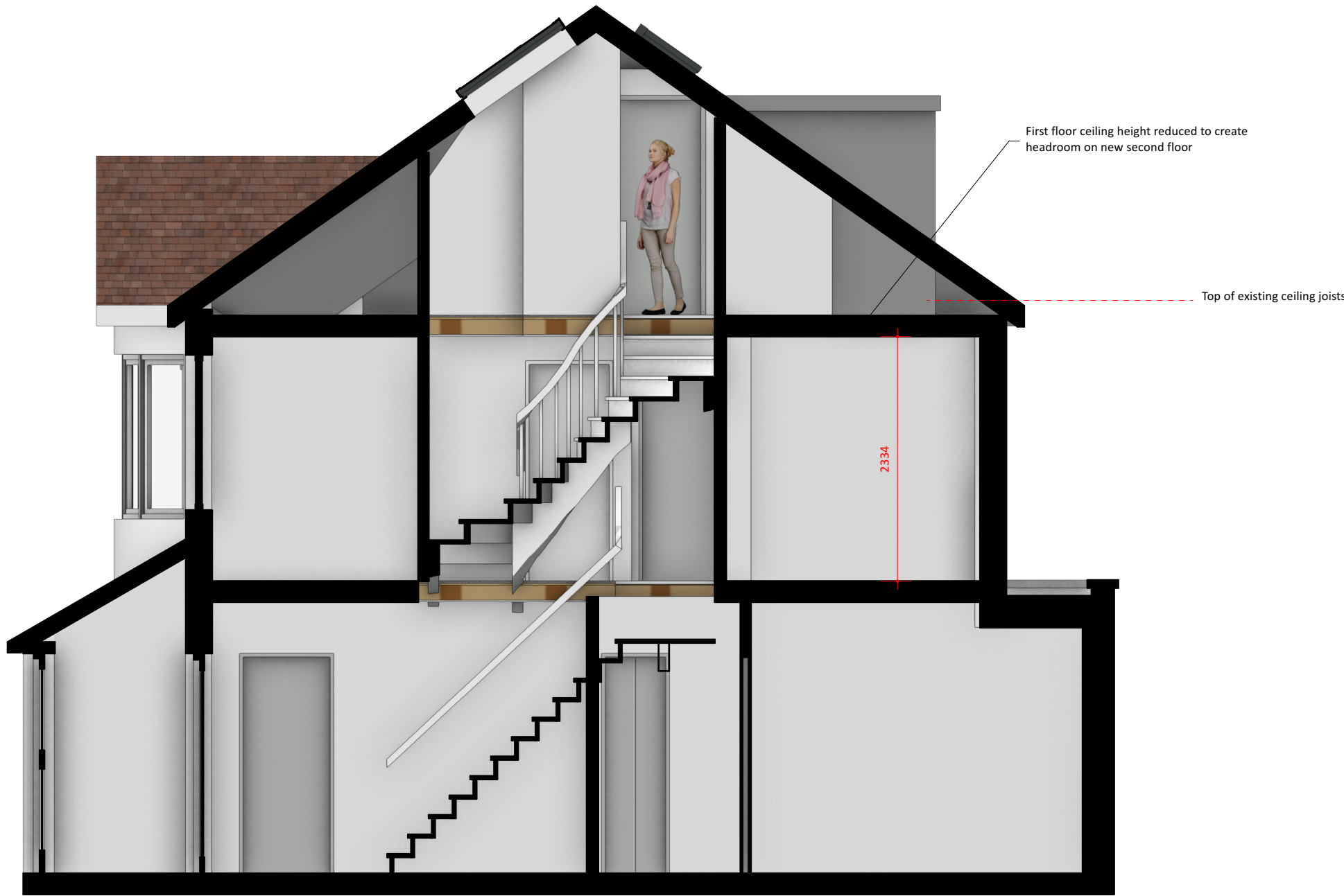
1 SECTION A-A