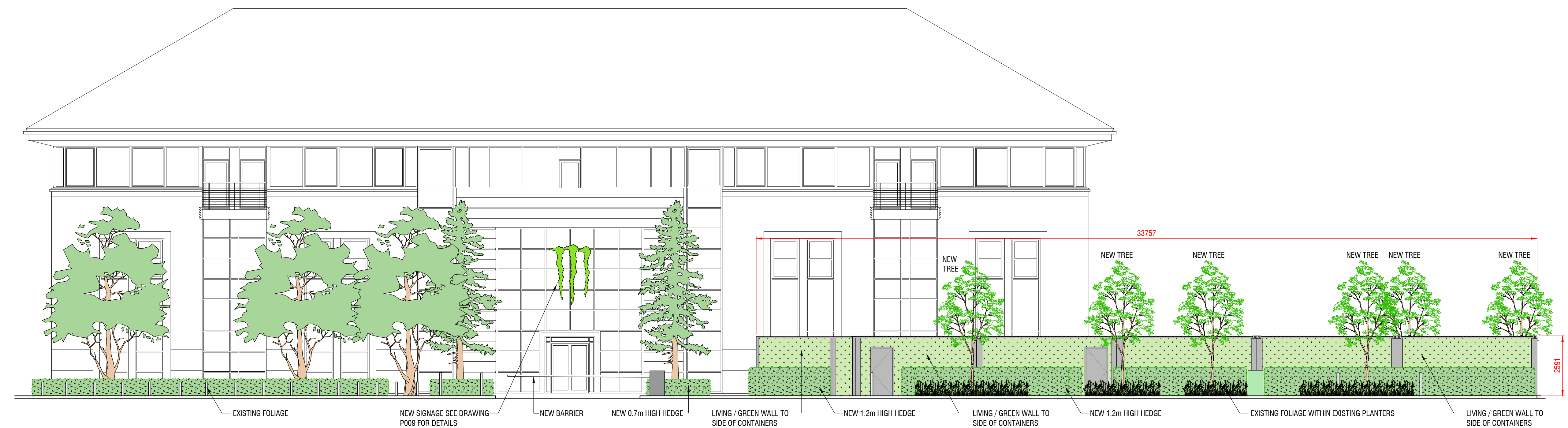
Proposed Elevation 'D-D'