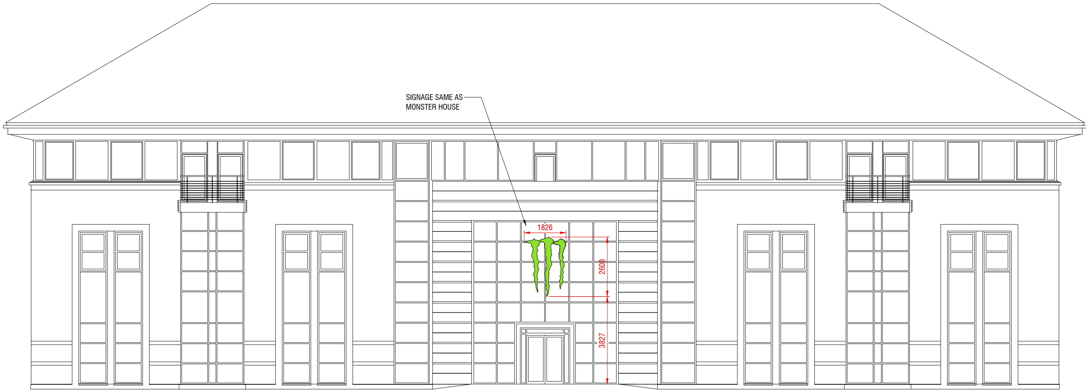
Proposed Front Elevation 'A' - Scale 1:100