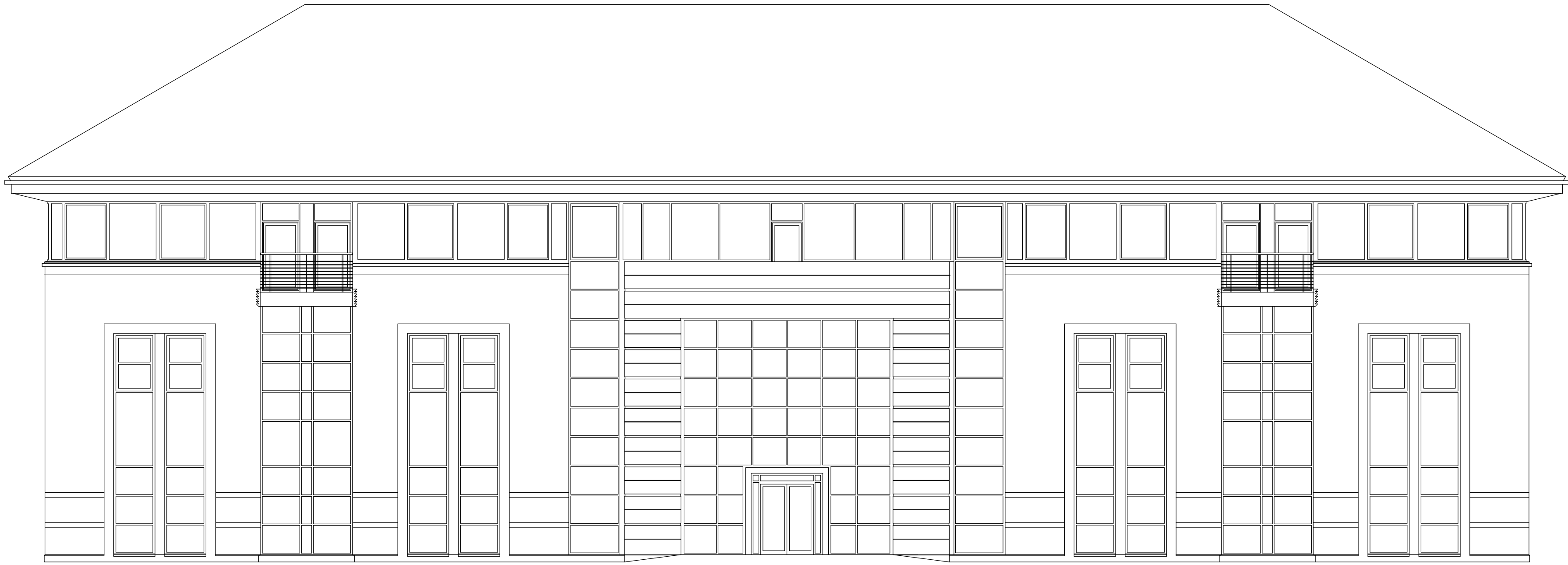
Existing Front Elevation 'A' - Scale 1:100