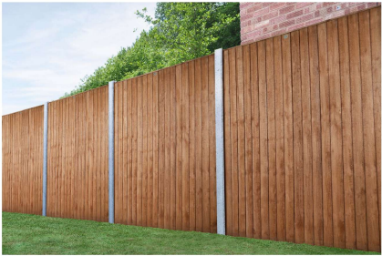
Closeboard fencing for raised patio 1.7m high from raised patio level at side of number 28 only