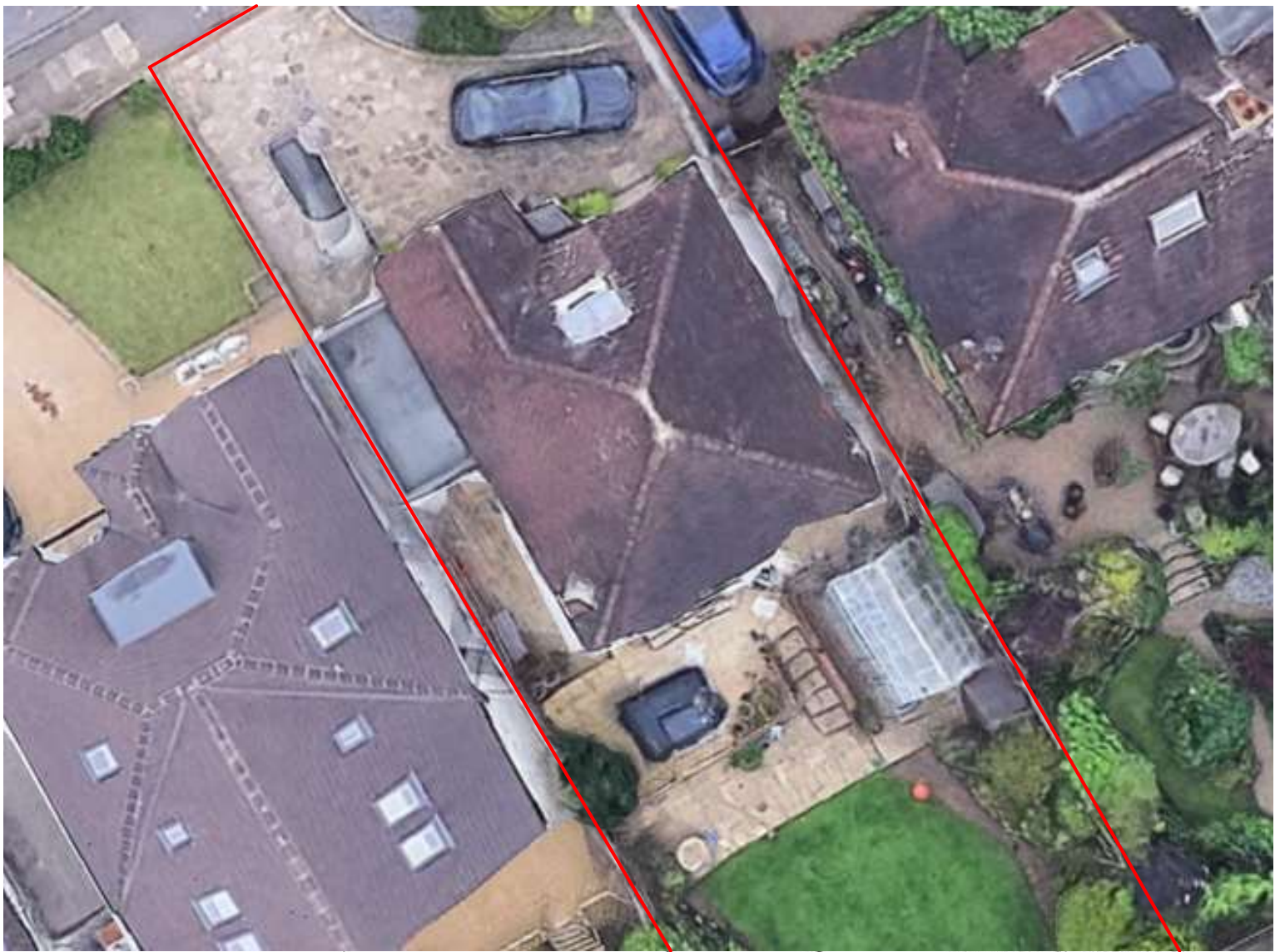
AERIAL VIEW Site shown in red

Description of proposed works Ground floor - Side to rear extension - Internal alterations - Rooflights