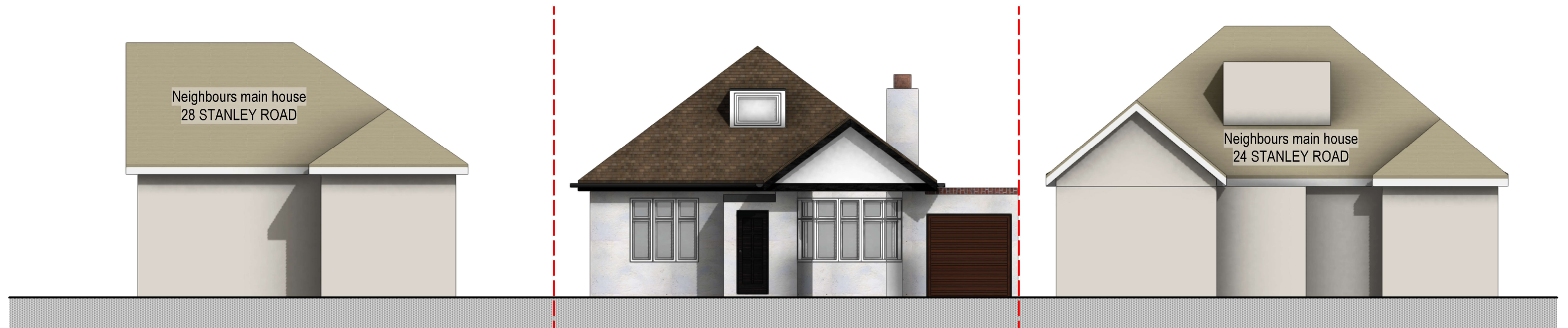
01 01 EXG ELEV FRONT Scale: 1:100