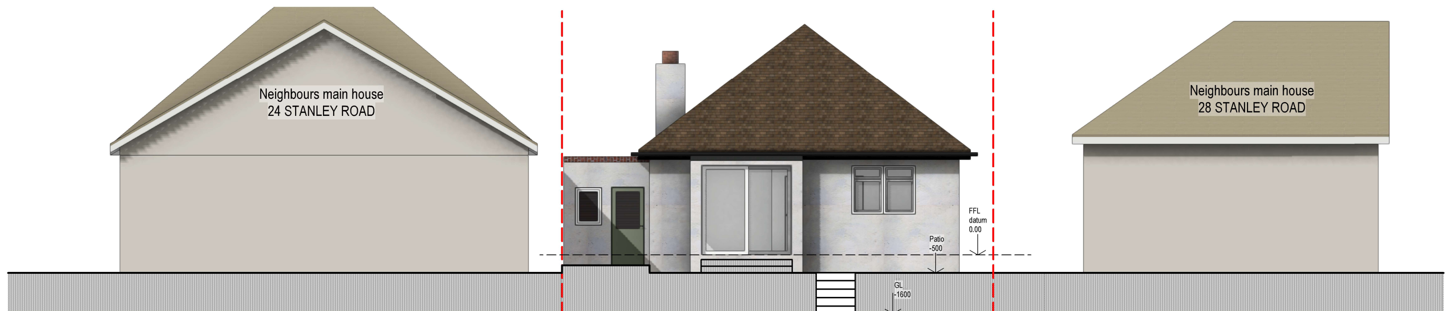
02 02 EXG ELEV REAR Scale: 1:100