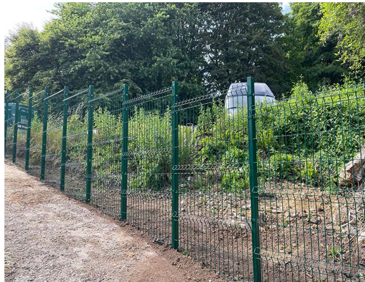
Proposed Fence Style