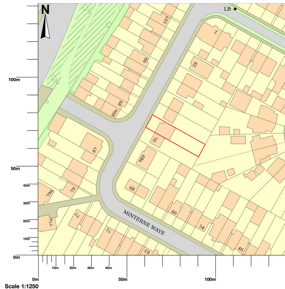
O1 LOCATION PLAN A3 SCALE: 1:1250

© Crown copyright and database rights 2025 OS 100054135. Map area bounded by: 511220,181112 511362,181254. Produced on 28 March 2025 from the OS National Geographic Database. Supplied by UKPlanningMaps.com. Unique plan reference: p2f/uk/1232877/1654959