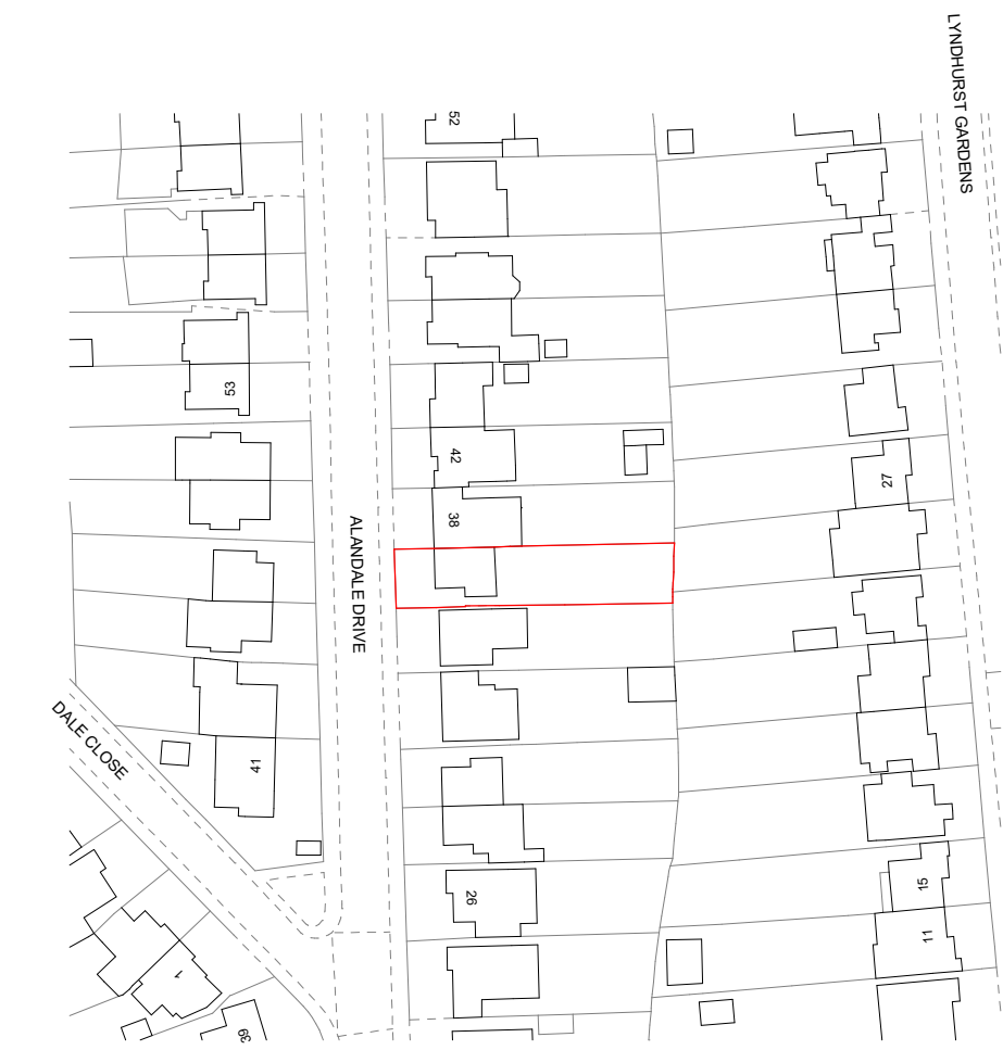
1 Location Plan 1 : 1250