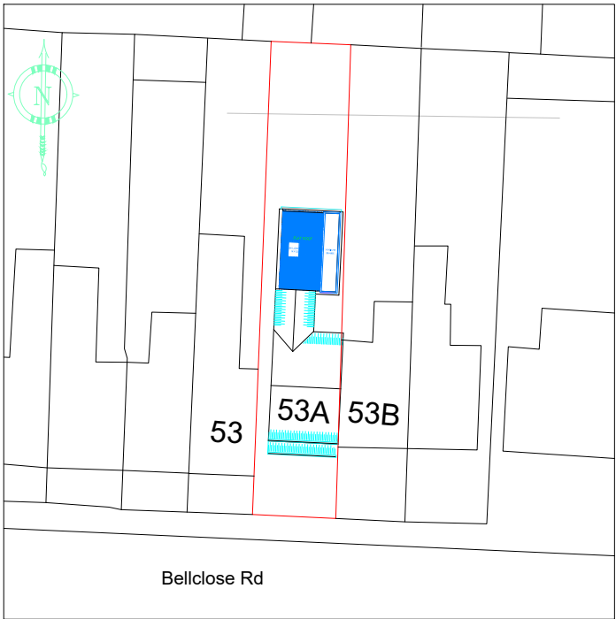
PROPOSED SITE PLAN SCALE: 1/500

THE CONTENTS OF THIS PLAN INCLUDING THE PRINTED NOTES ARE COPYRIGHT AND REPRODUCTION IN WHOLE OR PART IS NOT PERMITTED WITHOUT PRIOR CONSENT OF MERVE TAY ARCHITECTURE IN WRITING.