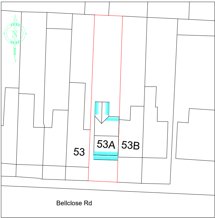
EXISTING SITE PLAN SCALE: 1/500

THE CONTENTS OF THIS PLAN INCLUDING THE PRINTED NOTES ARE COPYRIGHT AND REPRODUCTION IN WHOLE OR PART IS NOT PERMITTED WITHOUT PRIOR CONSENT OF MERVE TAY ARCHITECTURE IN WRITING.