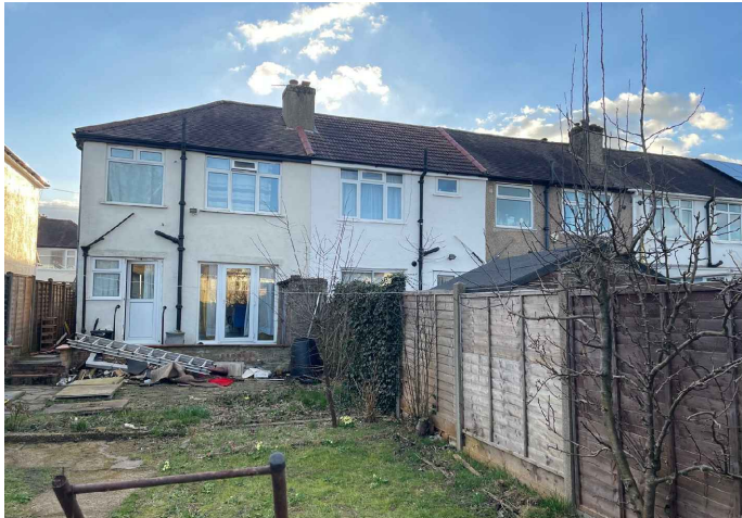
EXISTING REAR IMAGE