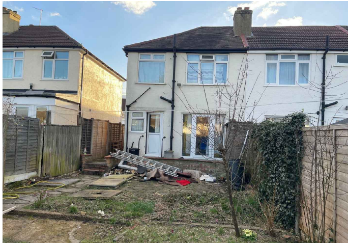
EXISTING REAR IMAGE