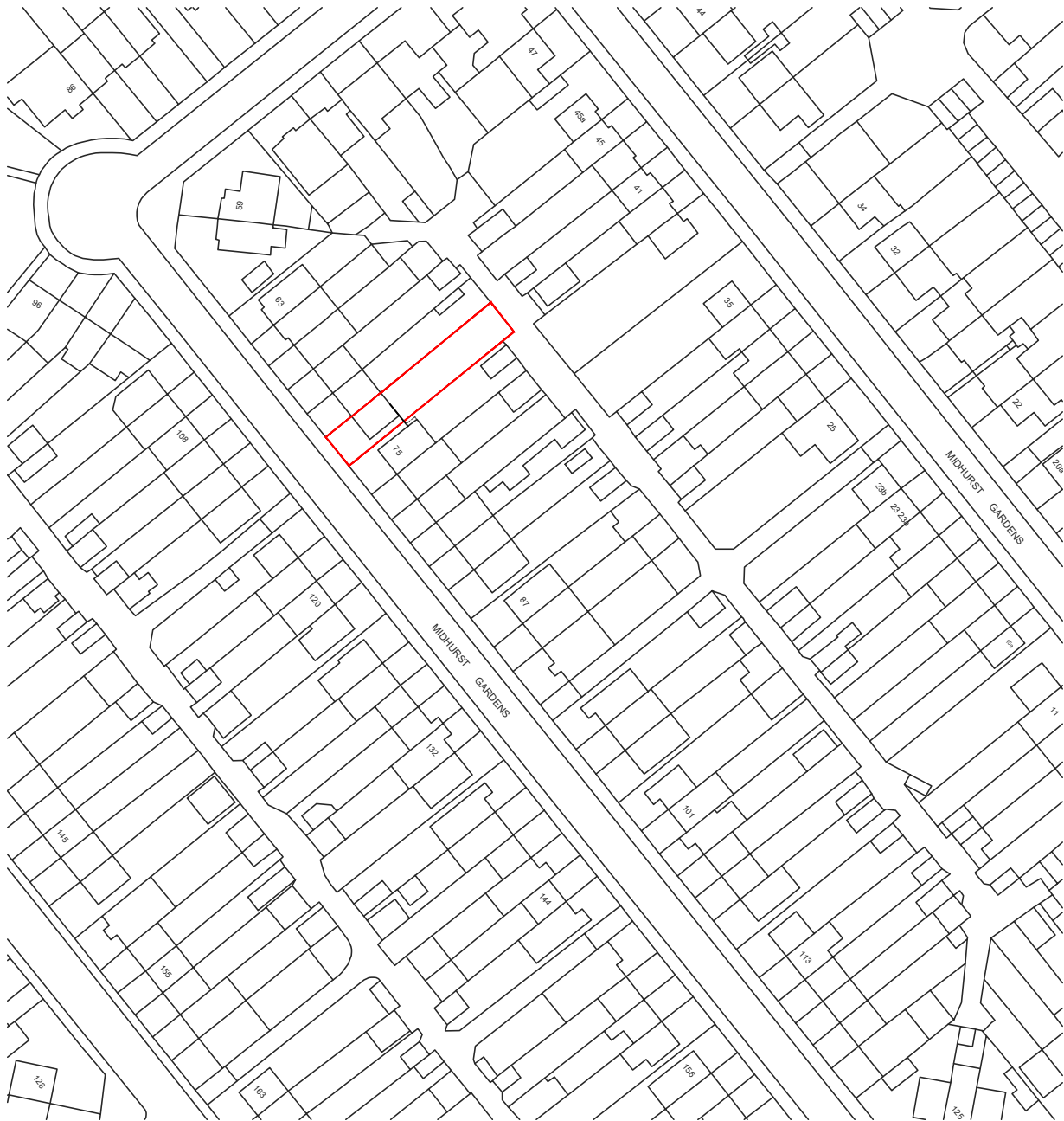
01 - OS MAP SCALE 1:1250