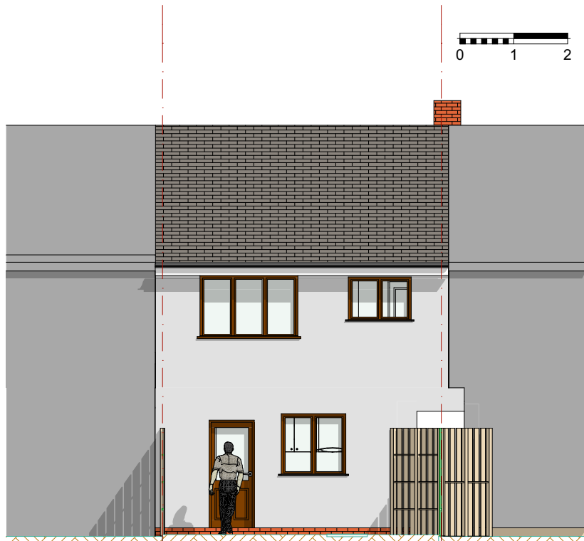
REAR ELEVATION NORTH EAST 1:100