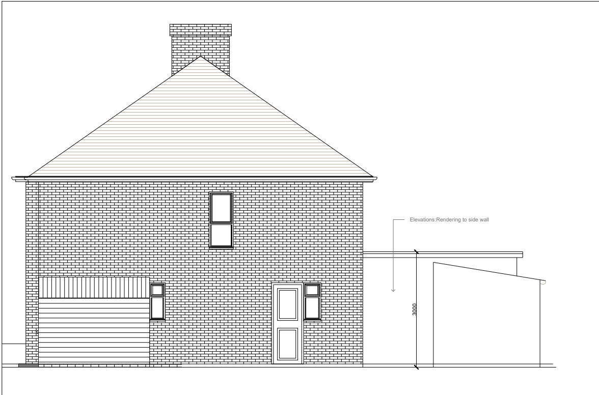
PROPOSED - SIDE 02 ELEVATION

All work to comply with current building regulations and codes of practice