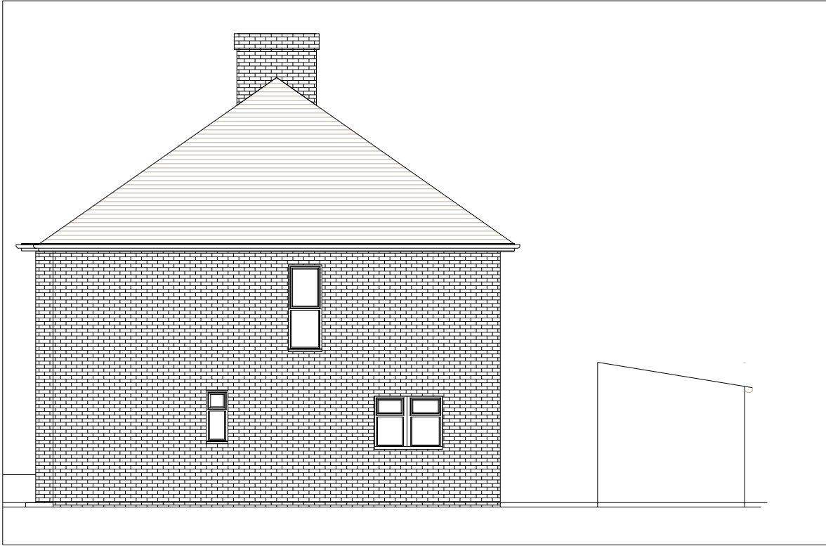
EXISTING - SIDE 02 ELEVATION