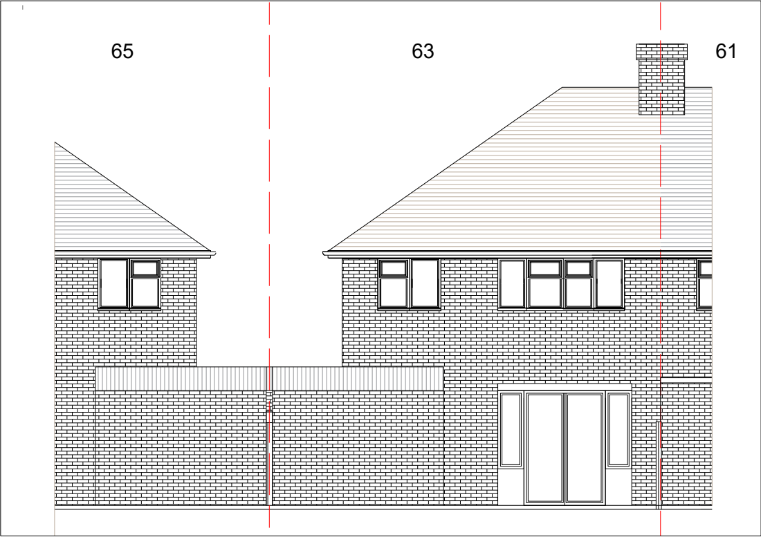
EXISTING - REAR ELEVATION