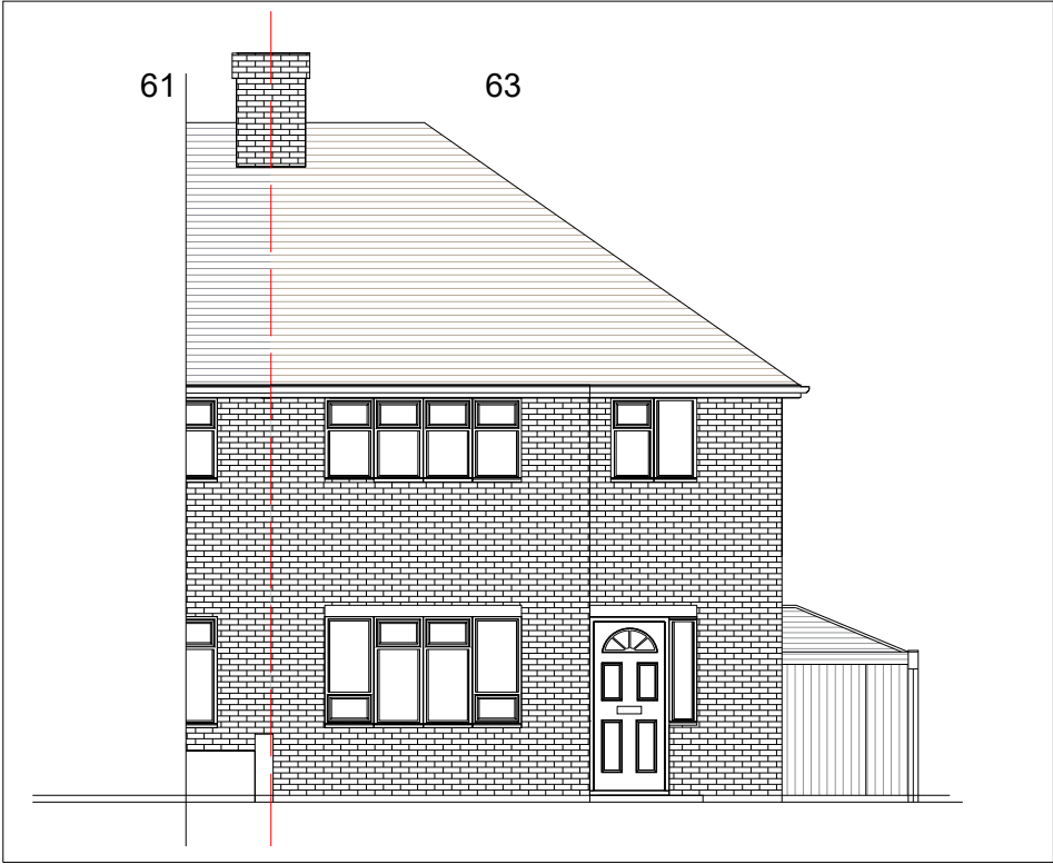
EXISTING - FRONT ELEVATION