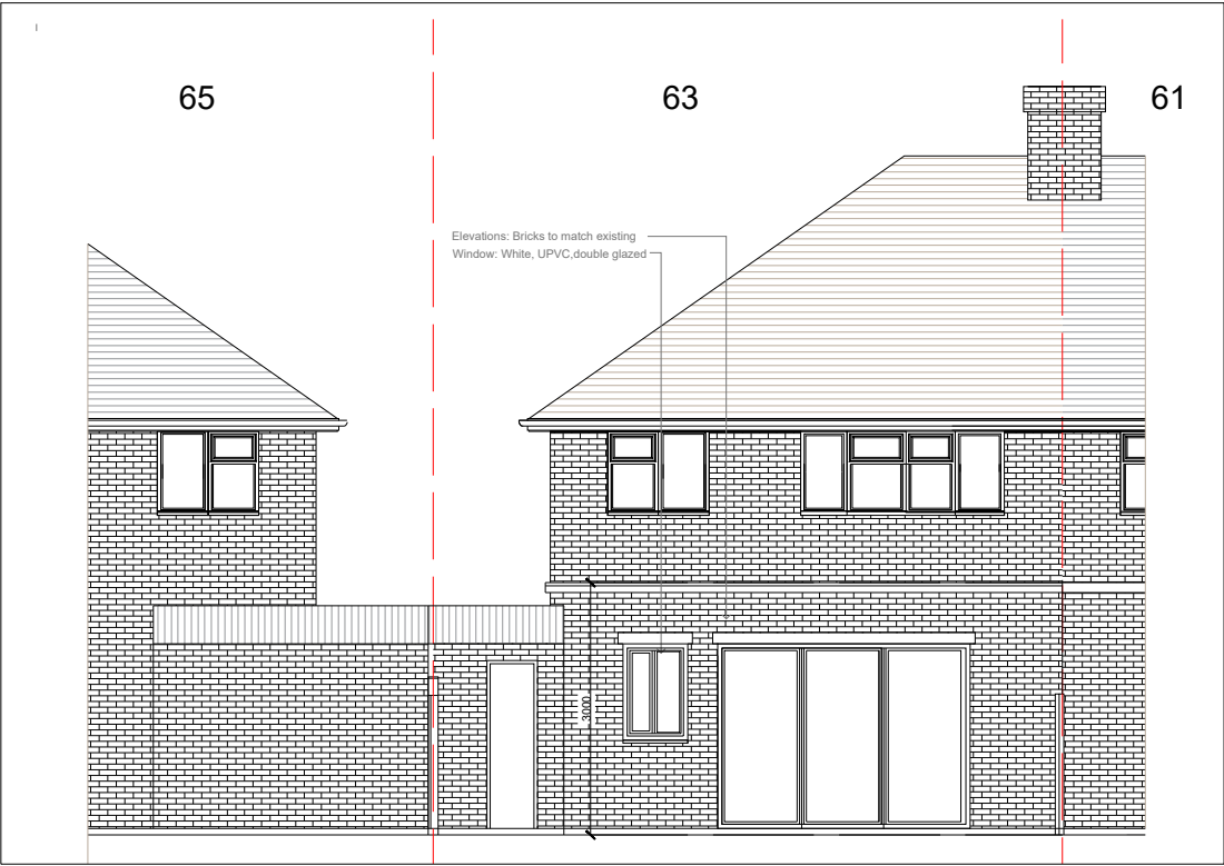
PROPOSED - REAR ELEVATION