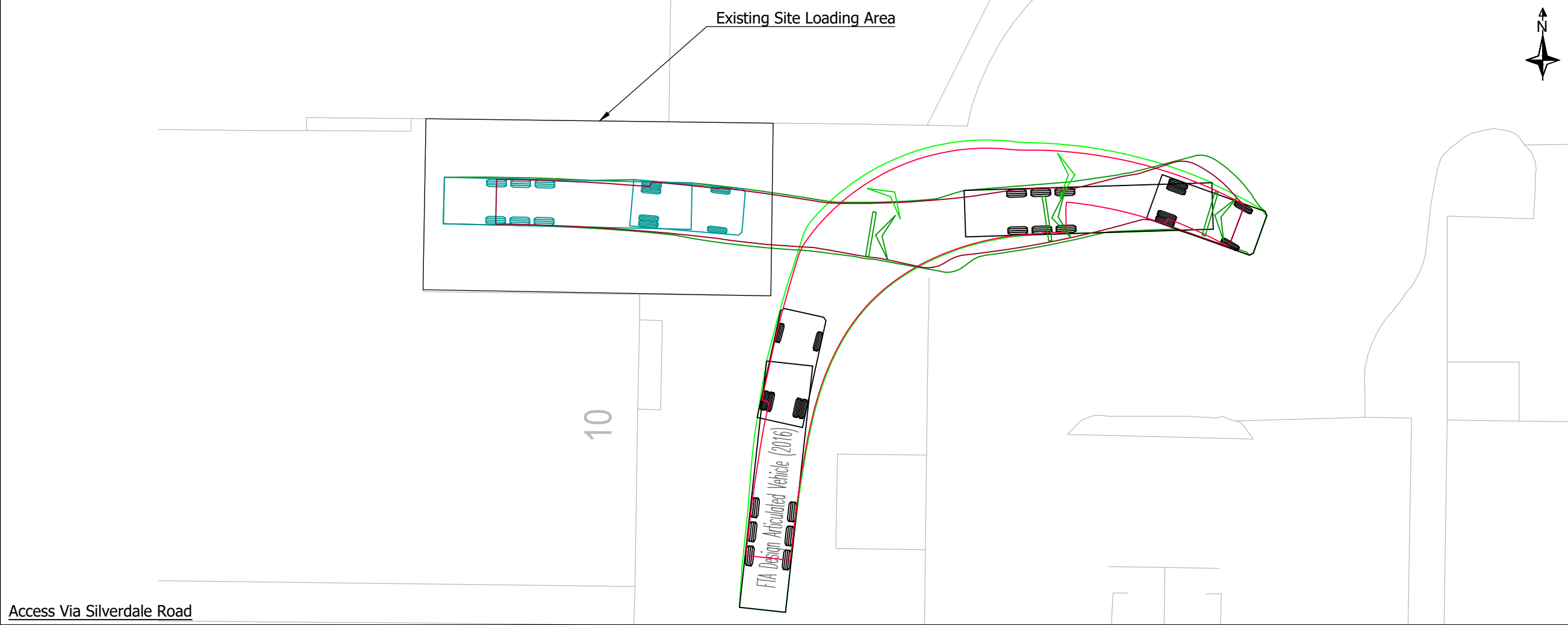
Access Via Silverdale Road