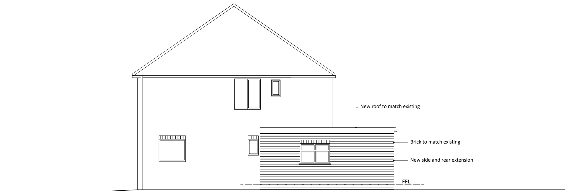
2 NORTH WEST