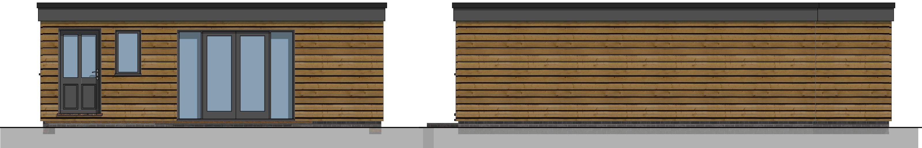
3 SE Elevation 1:50 NE Elevation 1:50