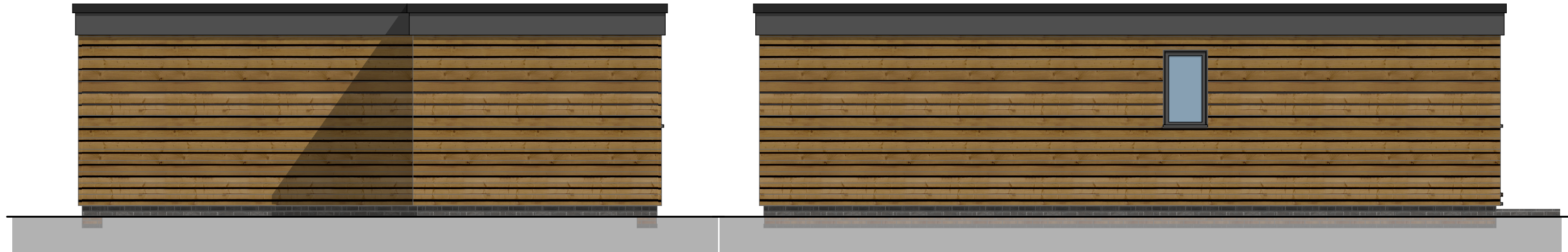
1 NW Elevation 1:50 SW Elevation 1:50