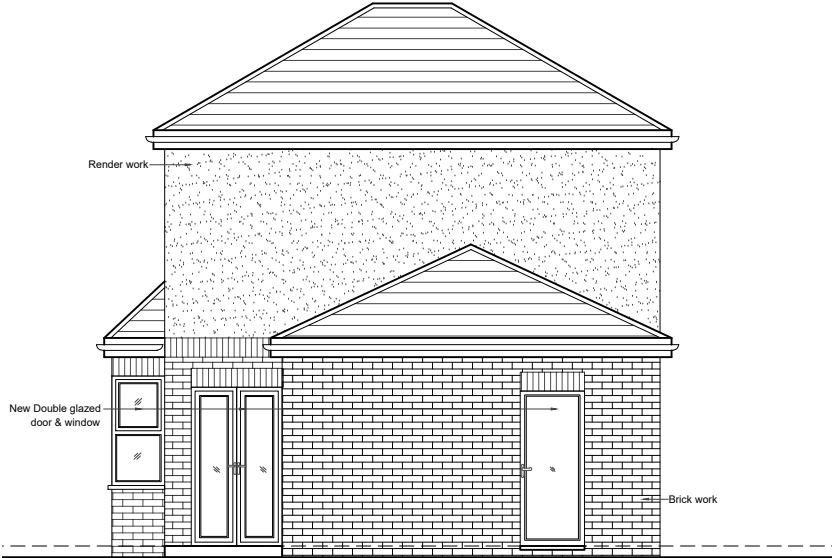
03 - RIGHT SIDE ELEVATION