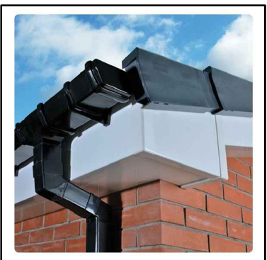
GUTTER & FASCIA COLOUR : BLACK & WHITE FINISH : UPVC LOCATION : BUILDING GUTTER LEVEL