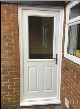
FRONT DOOR COLOUR : WHITE FINISH : HALF GLAZED COMPOSITE LOCATION : TO FRONT WALL