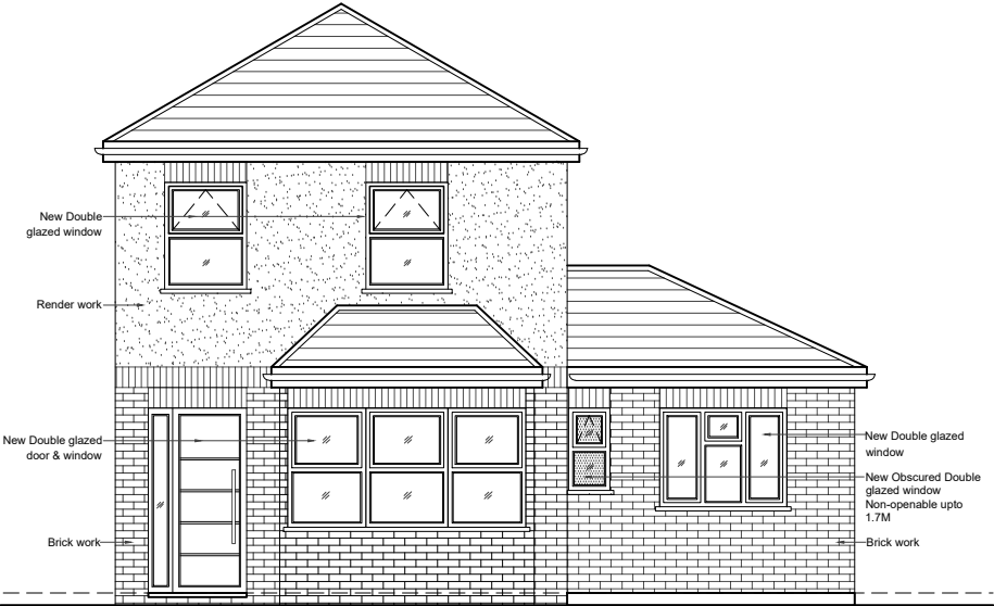
01 - FRONT ELEVATION