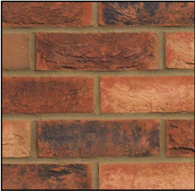
FACING BRICKWORK COLOUR : RED AND BROWN MULTI-FACED BRICK FINISH : RED AND BROWN FACED LOCATION : TO EXTERNAL WALL