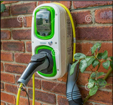
INDICATIVE CAR CHARGING POINT LOCATION : TO EXTERNAL WALL @ FRONT