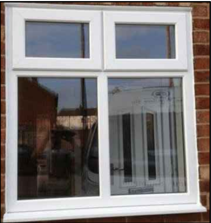
WINDOWS COLOUR : WHITE UPVC WINDOWS FINISH : POWDER COATED ALUMINIUM LOCATION : TO EXTERNAL WALL