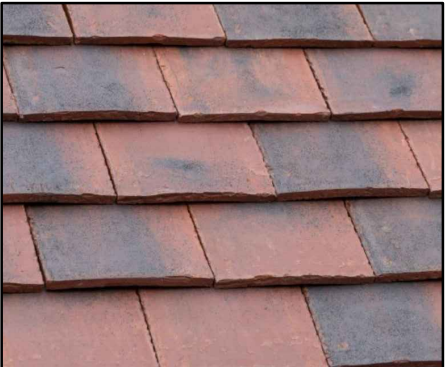
ROOF TILES COLOUR : MARLEY ASHDOWNE HANDCRAFTED ASHURST FINISH : CLAY LOCATION : TO ROOF