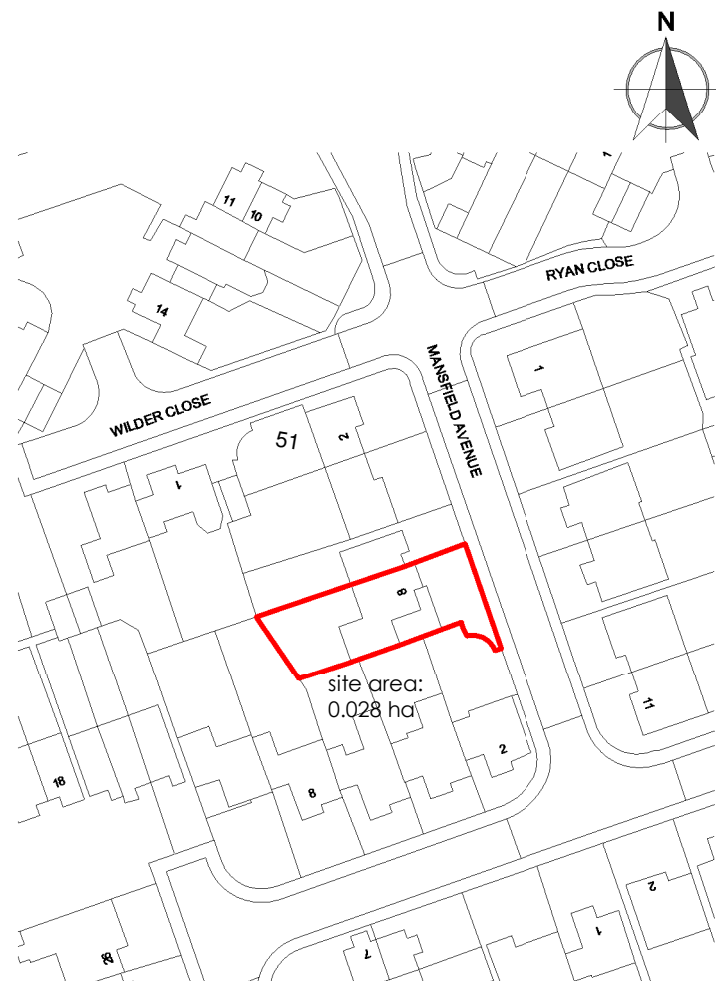
1 Location Plan 2508-L-100 1 : 1000

neighbour extension approved in 2024 (ref: 78903/APP/2024/1852