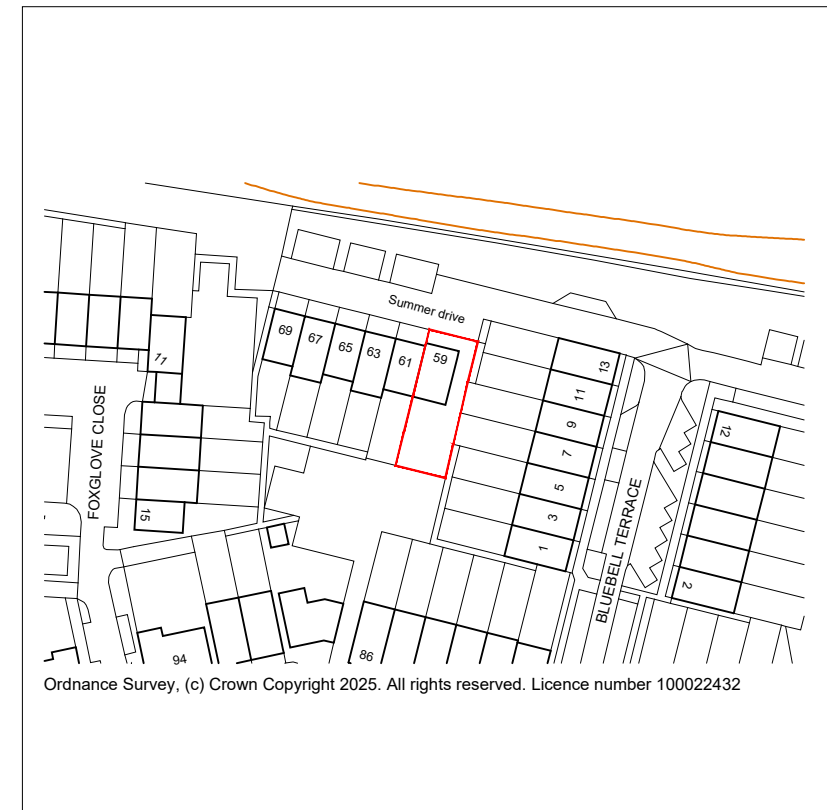
LOCATION PLAN SCALE 1 : 1250

SK Design Consultants 22 Netley close Caversham Reading RG4 6SR Tel : 07821111602