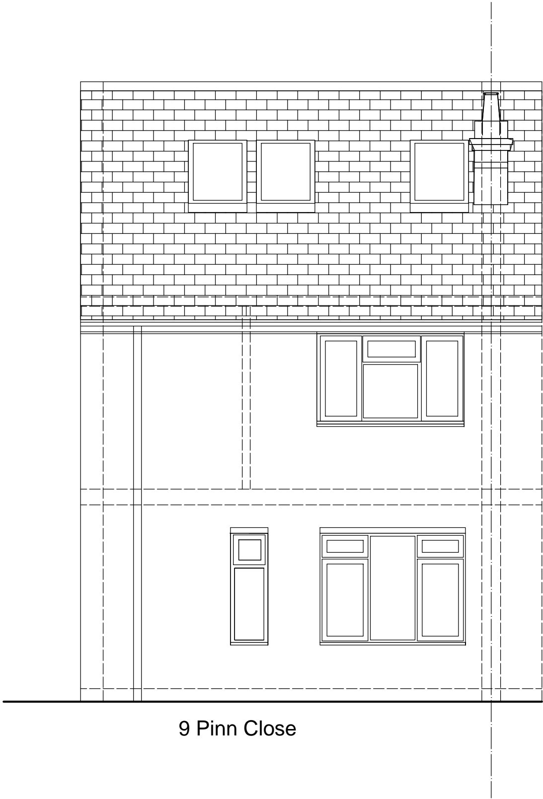
9 Pinn Close

Application for a Lawful Development Certificate for a Proposed use or development Town and Country Planning Act 1990 (as amended) and The Town and Country Planning (Development Management Procedure) (England) Order 2015 (as amended).