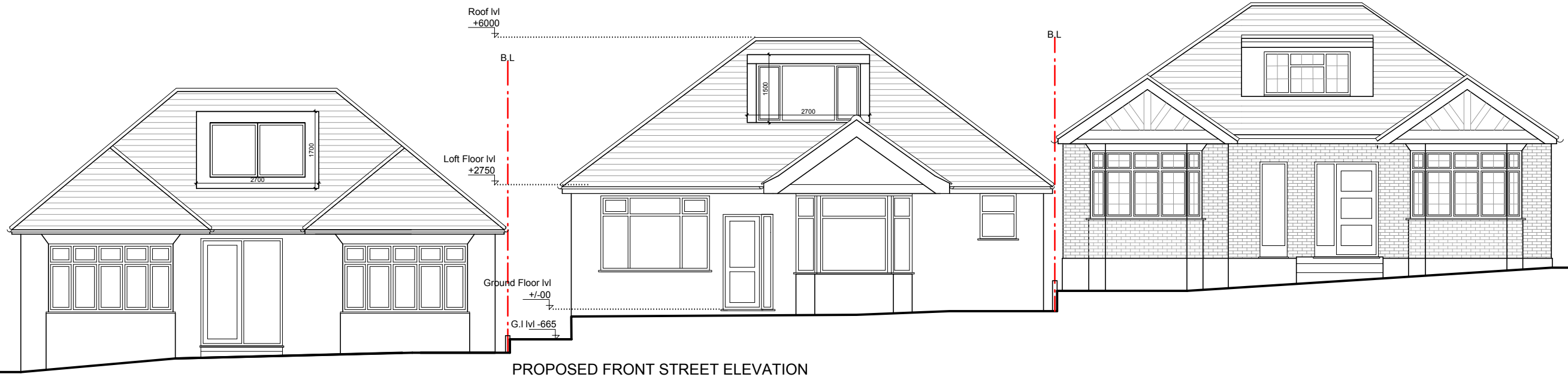
PROPOSED FRONT STREET ELEVATION