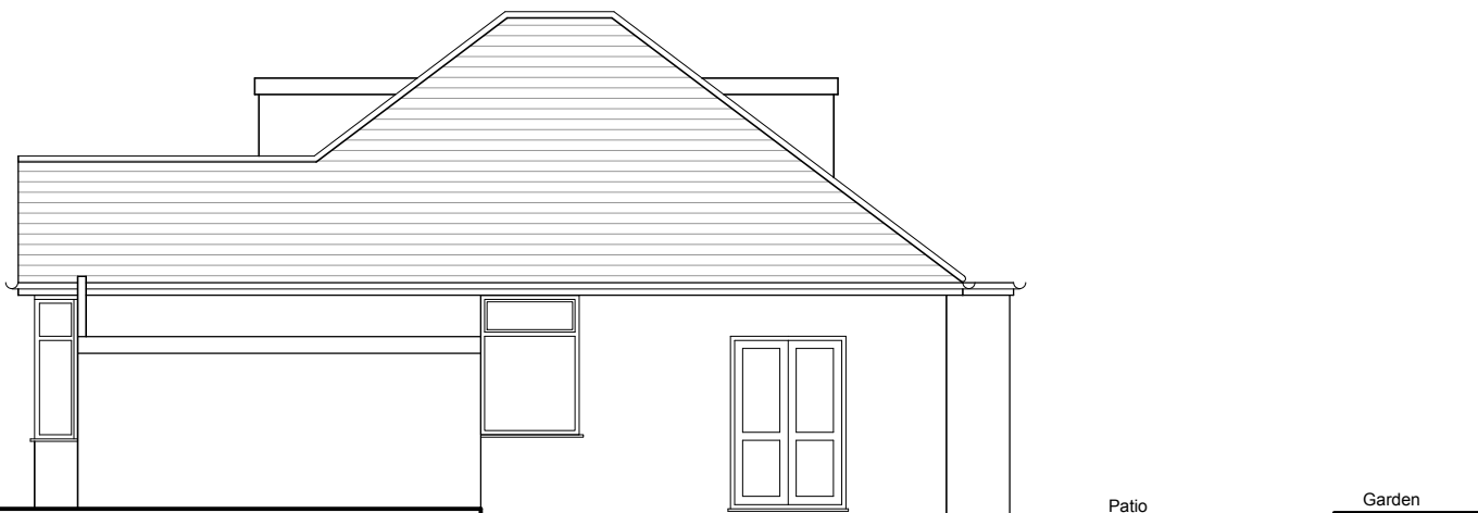
EXISTING SIDE (RHS) ELEVATION