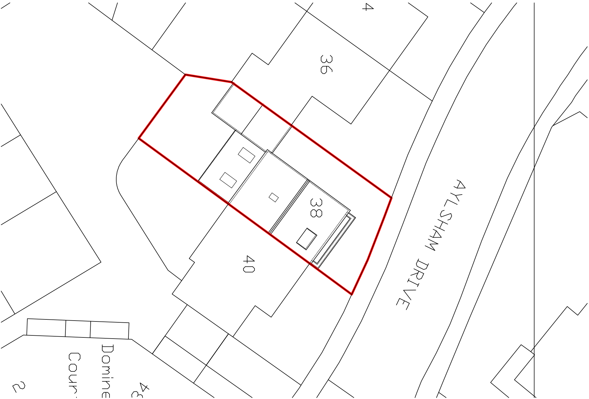
Site Plan 1:200