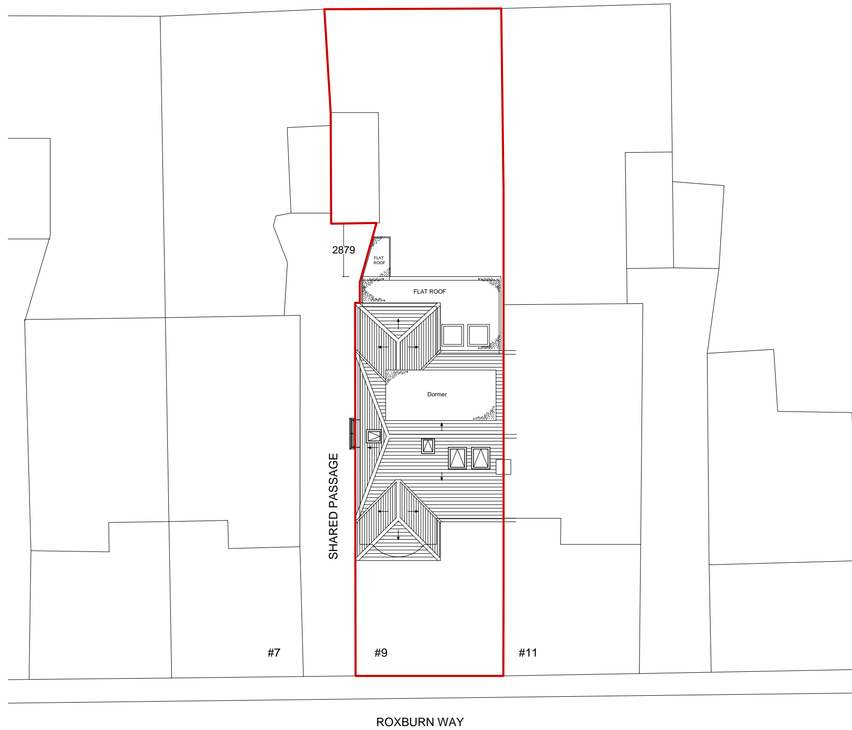
BLOCK PLAN SCALE 1:200