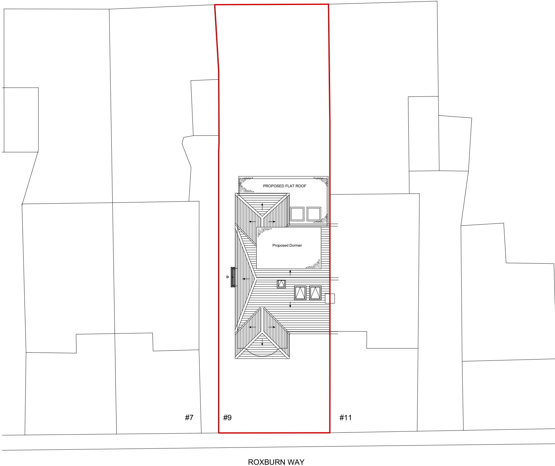
BLOCK PLAN SCALE 1:200