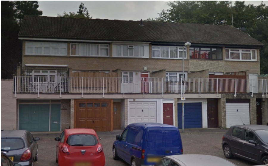
5. Front elevation of application propoerty no.26 and neighbouring properties from the highway