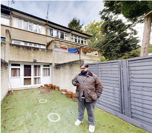
7. Rear elevation of application propoerty no.26 and neighbouring property no.25