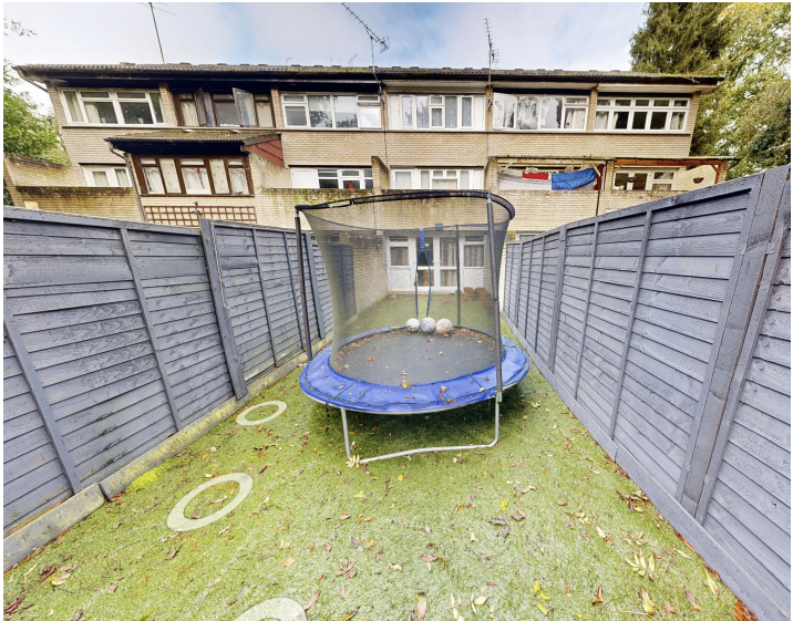
4. Rear elevation of application propoerty no.26