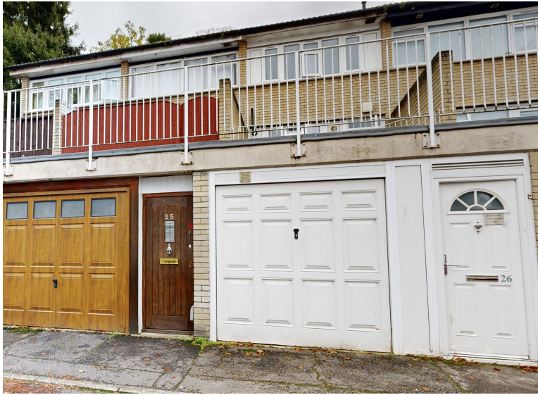
2. Front elevation of application propoerty no.26 and neighbouring property no.25