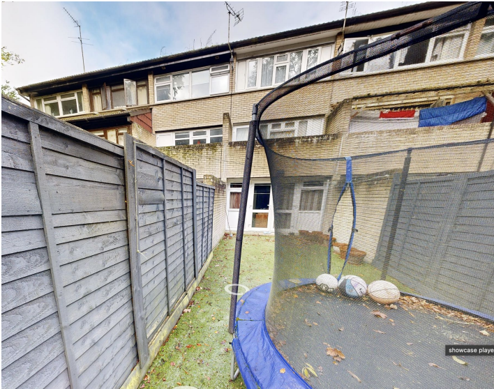
6. Rear elevation of application property no.26 and neighbouring property no.27