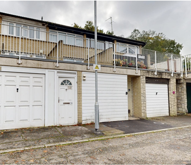
3. Front elevation of application propoerty no.26 and neighbouring property no.27