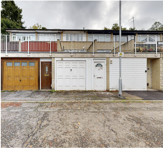
1. Front elevation of application propoerty no.26