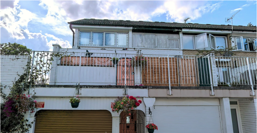
6 - Front facades of no. 1-2 Sanctuary Close Note extended boundary wall/fences height