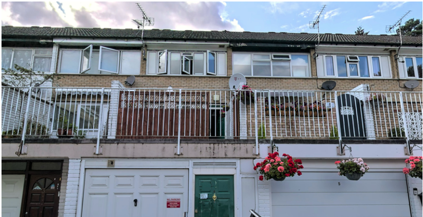
5 - Front facades of no. 4-5 Sanctuary Close