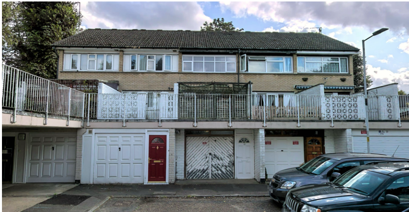
2 - Front facades of no. 19-23 Sanctuary Close