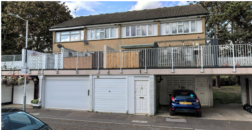
3 - Front facades of no. 9-12 Sanctuary Close