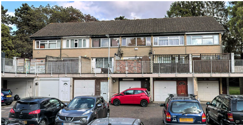
1 - Front facades of no. 13-18 Sanctuary Close Note extended boundary wall/fences height