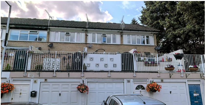
4 - Front facades of no. 6-8 Sanctuary Close Note extended boundary wall/fences height