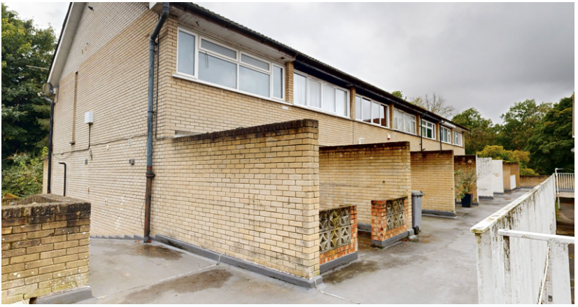
5 - Front facade of no. 30 Sanctuary Close