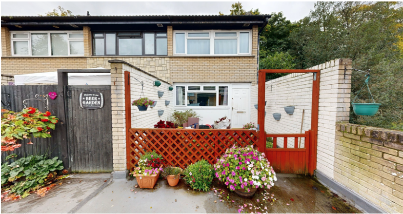
4 - Front facade of no. 29 Sanctuary Close Note extended boundary wall/fences height