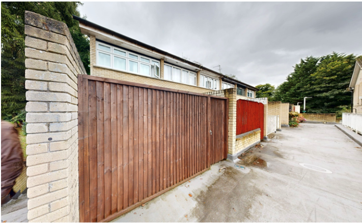
1 - Front facade of no. 24 Sanctuary Close