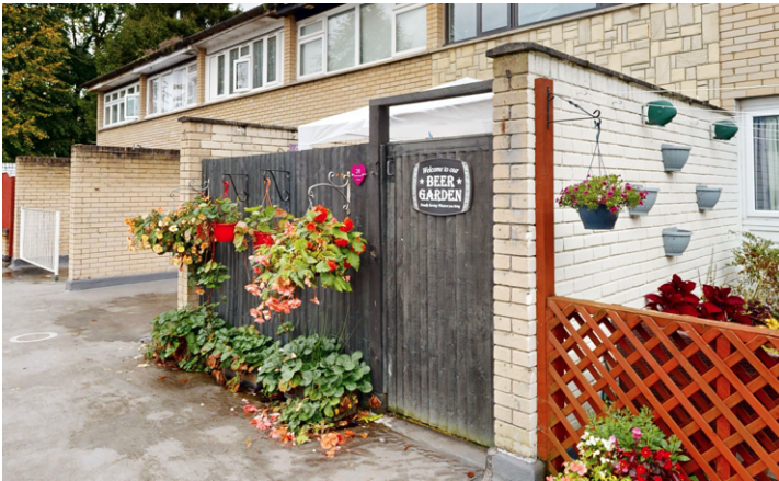
3 - Front facade of no. 28 Sanctuary Close Note extended height of close boarded fencing