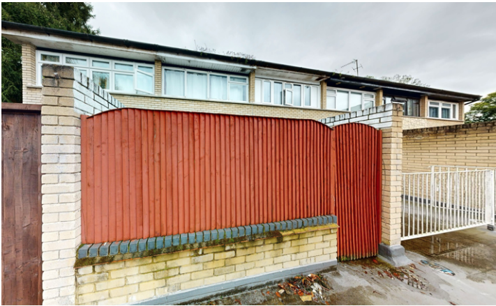
2 - Front facade of no. 25 Sanctuary Close Note extended height of close boarded fencing