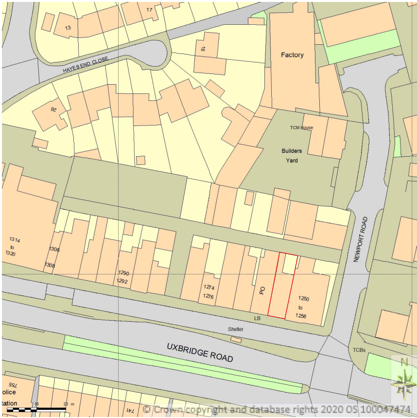
Location Plan @ 1:1250

Change of use from Class E to Sui-Genesis