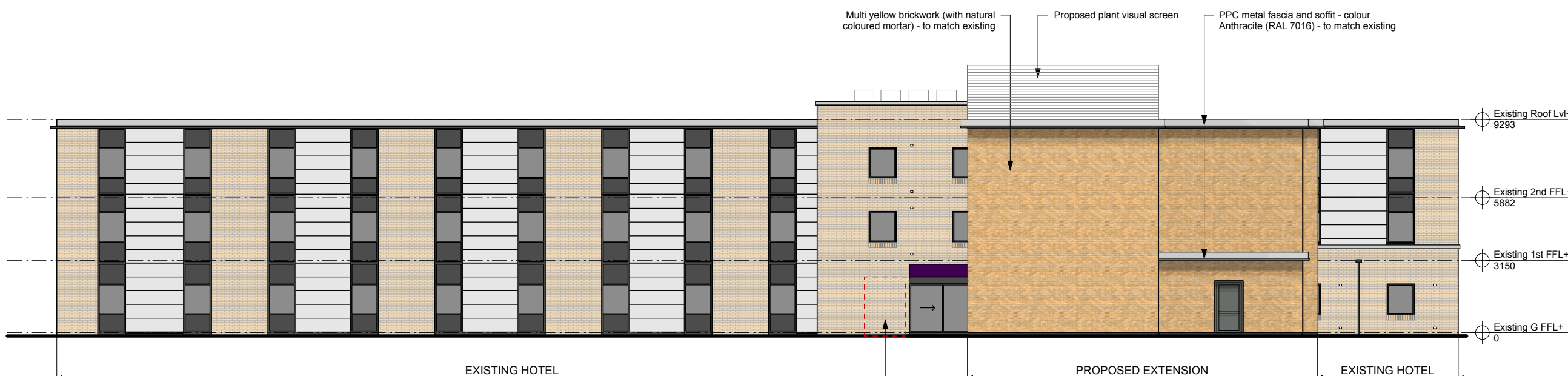
1 Proposed South Elevation Scale: 1:200

Hopper & downpipes (where exposed): Black UPVC