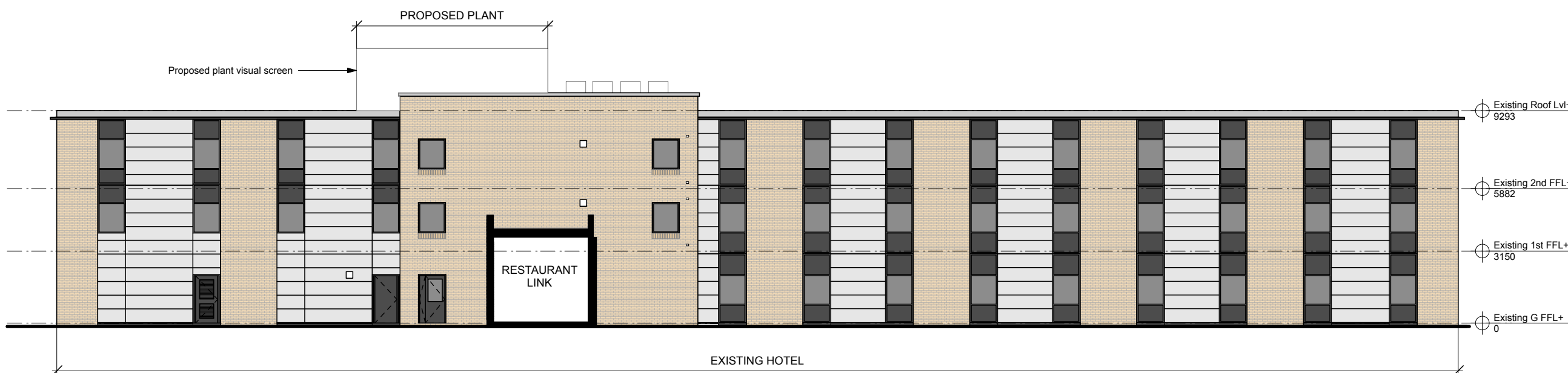
2 Existing North Elevation(restaurant link) Scale: 1:200

Existing opening to be infilled with multi-yellow brickwork and natural-coloured mortar to match the existing.