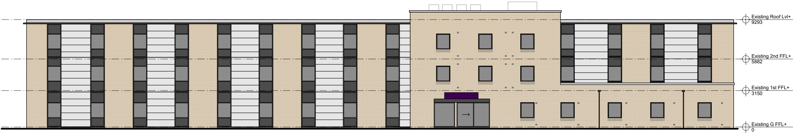
01 Existing South Elevation Scale: 1:200

Hopper & downpipes (where exposed): Black UPVC