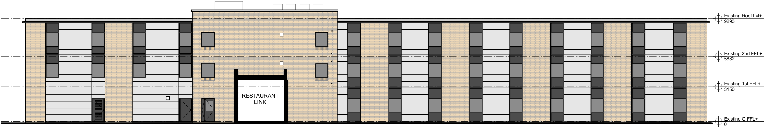
02 Existing North Elevation Scale: 1:200