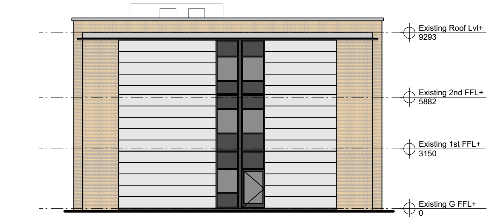
03 Existing West Elevation Scale: 1:200