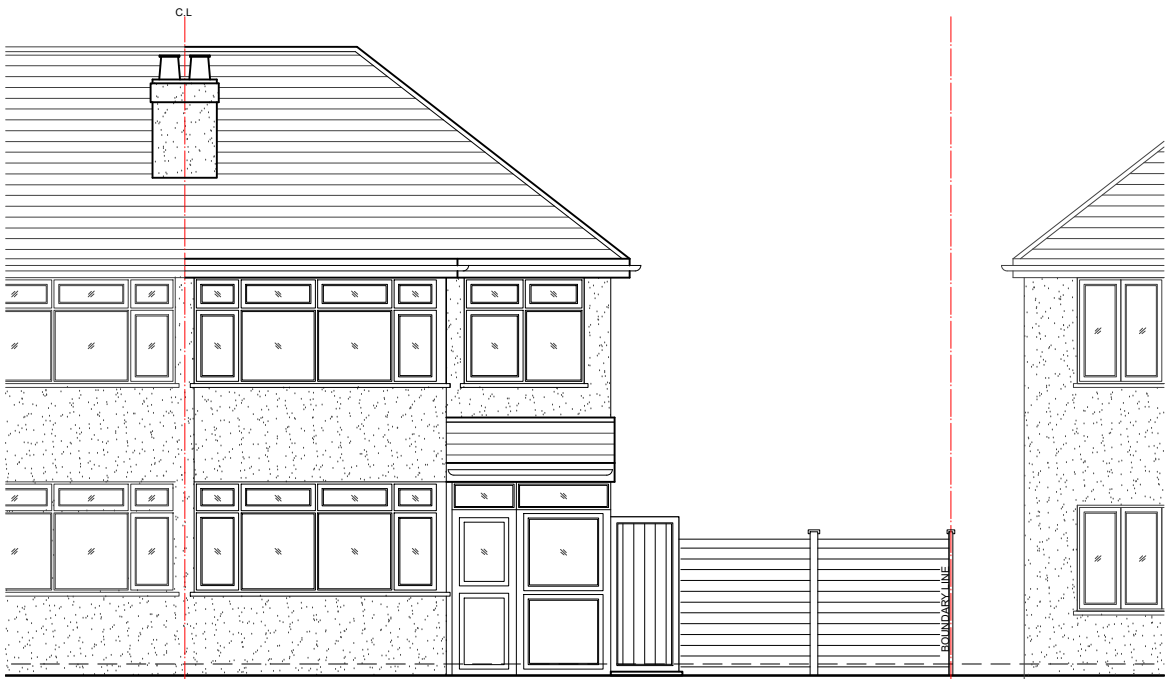
01 - FRONT ELEVATION