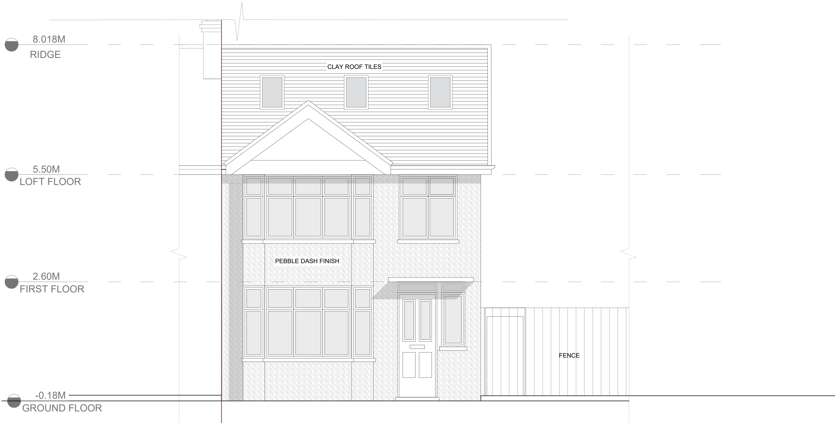
FRONT ELEVATION| 1:50