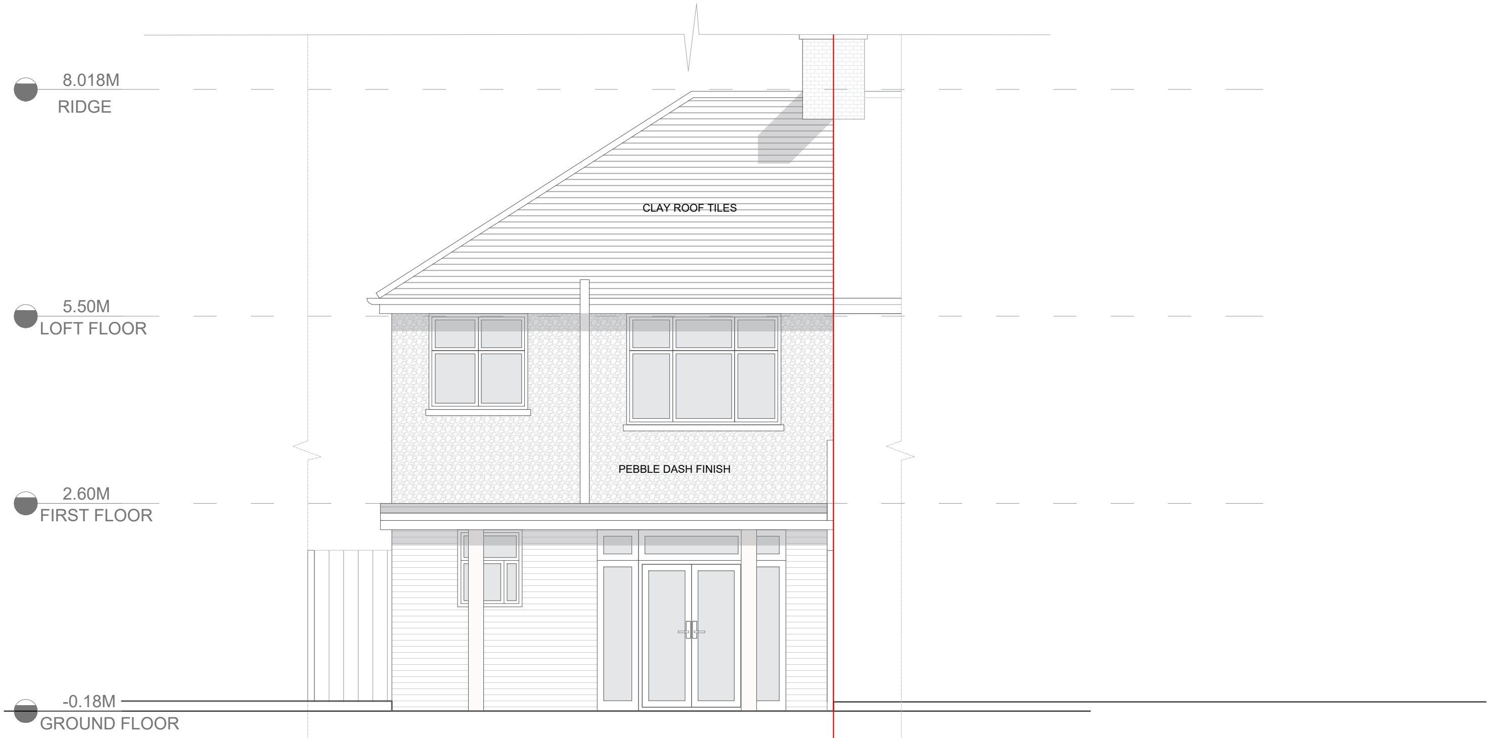
REAR ELEVATION| 1:50