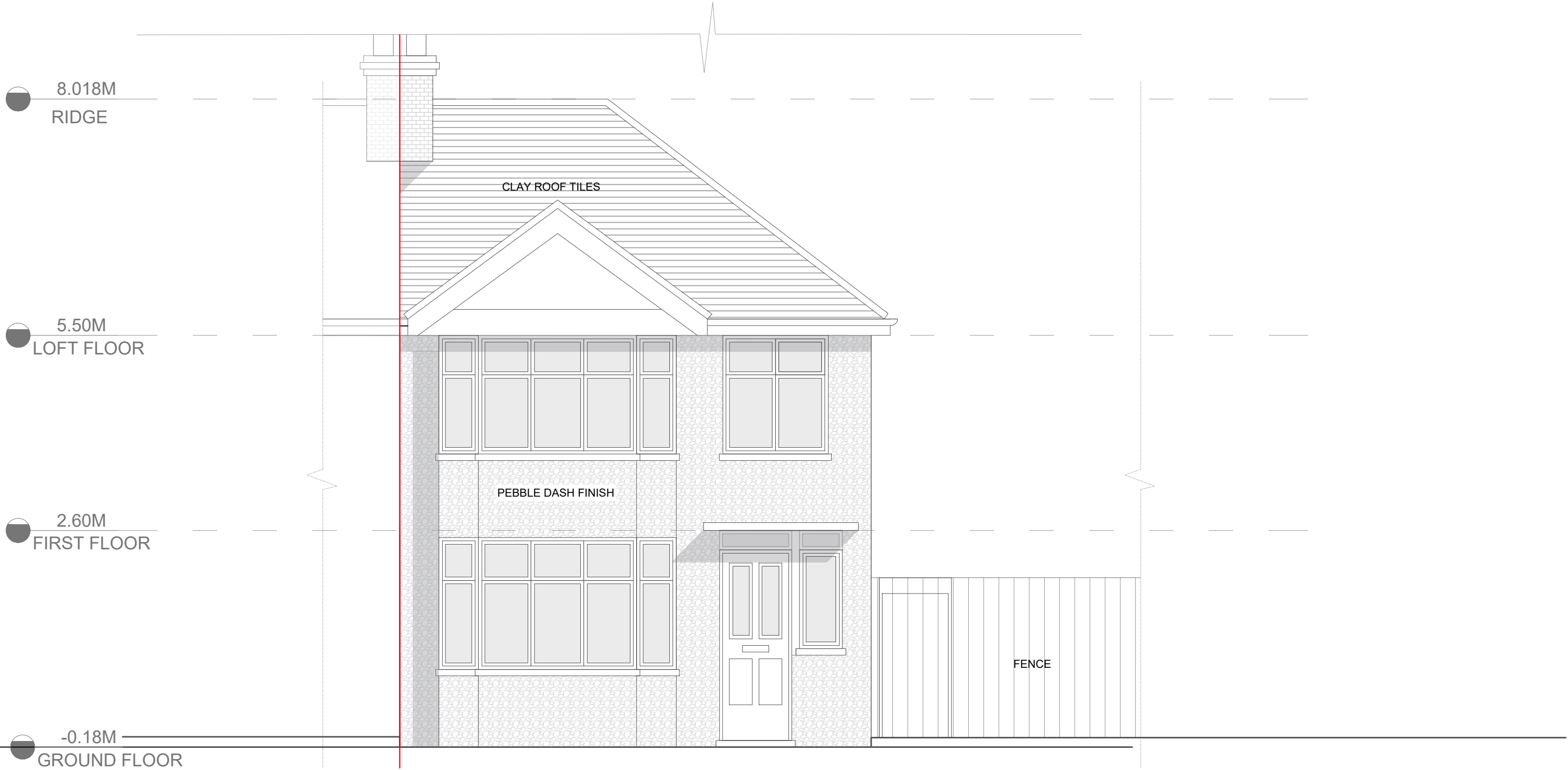
FRONT ELEVATION| 1:50