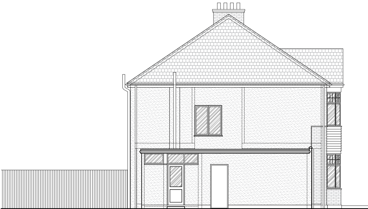
EXISTING SIDE ELEVATION - B