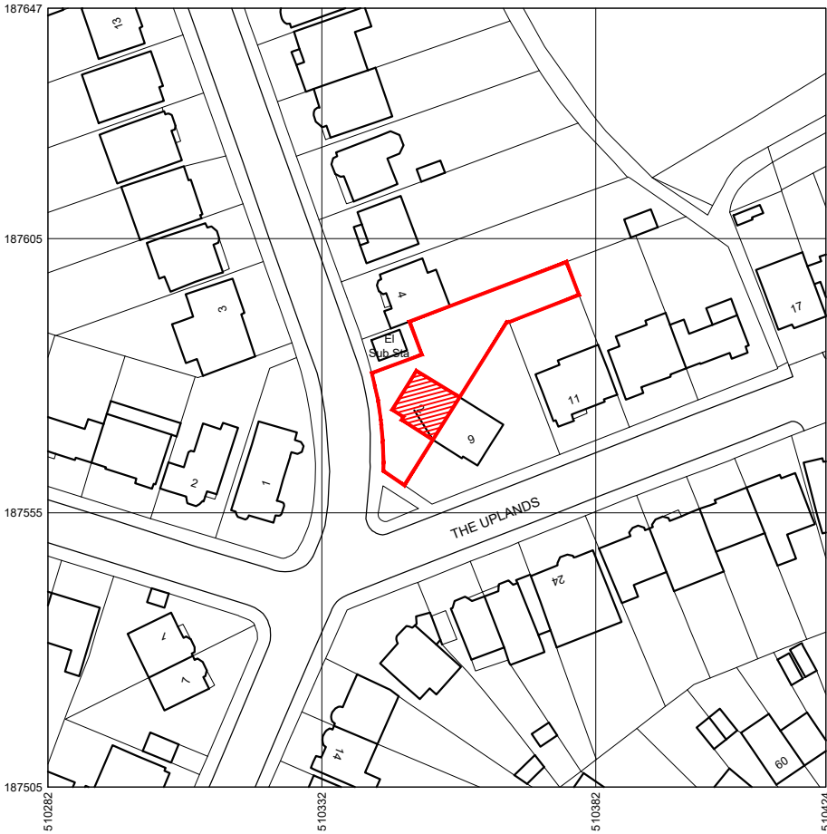
LOCATION PLAN Scale: 1:1250 @ A3