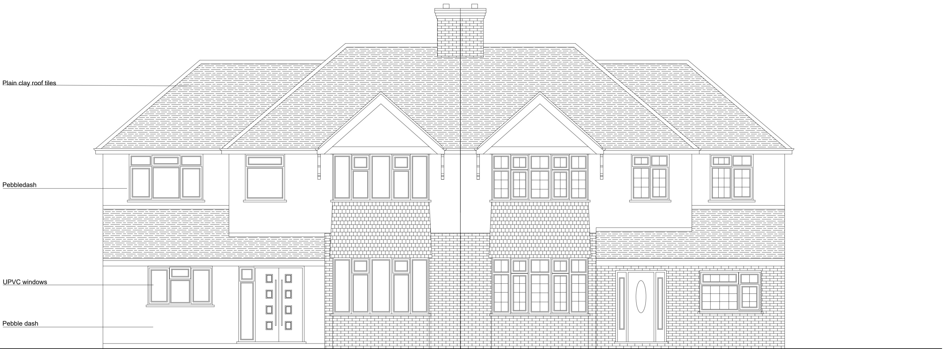
ELEVATION A EXISTING FRONT ELEVATION