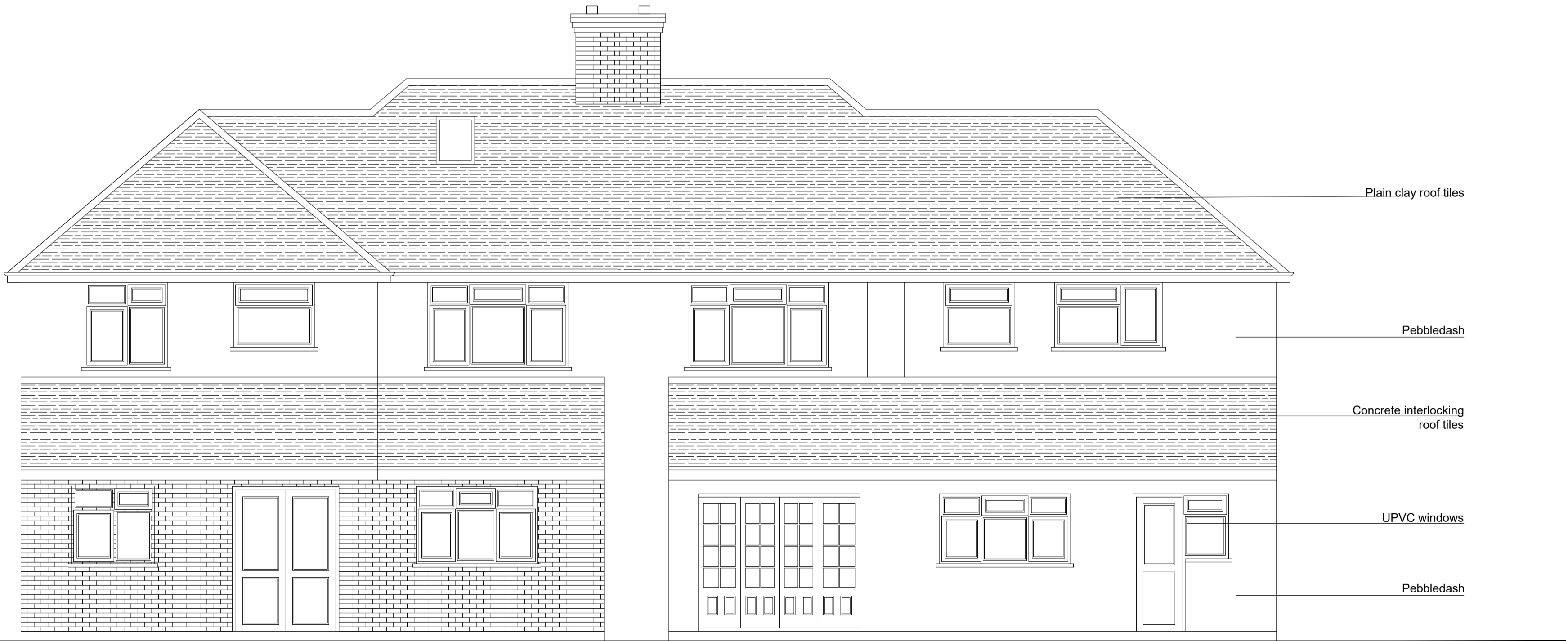
ELEVATION C EXISTING REAR ELEVATION