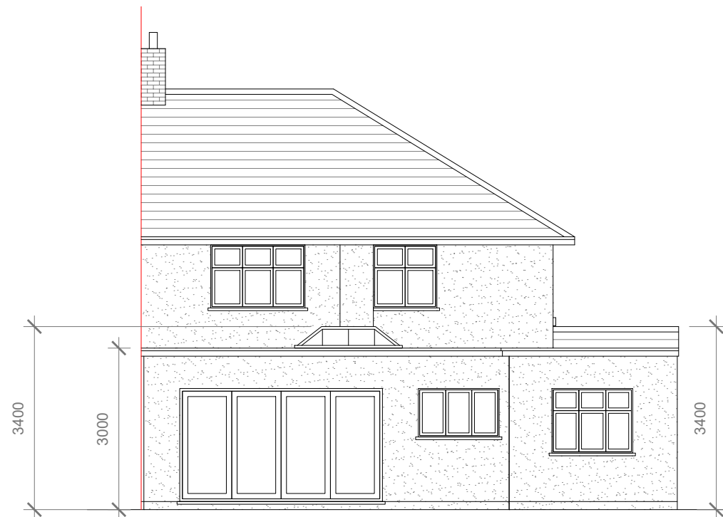
Proposed Rear Elevation Scale 1:100

Proposed Flank Wall Window to be Obscure Glazed and Non Opening below 1.7m from FFL