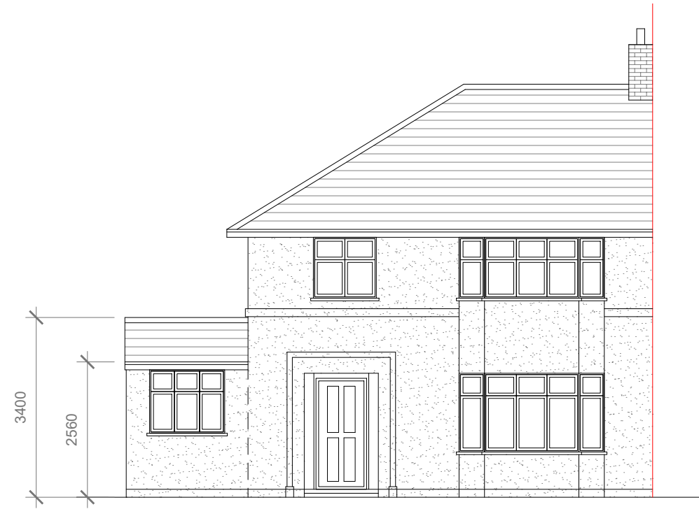
Proposed Front Elevation Scale 1:100