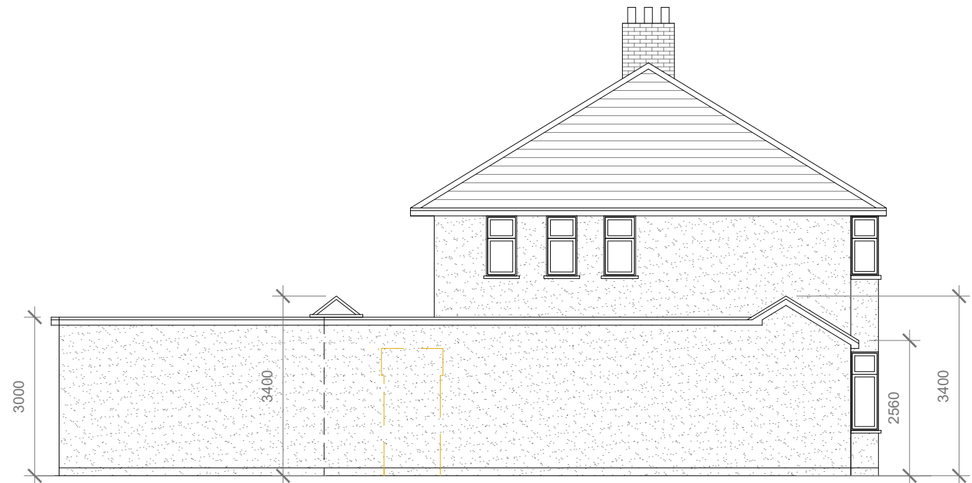
Proposed Side Elevation Scale 1:100