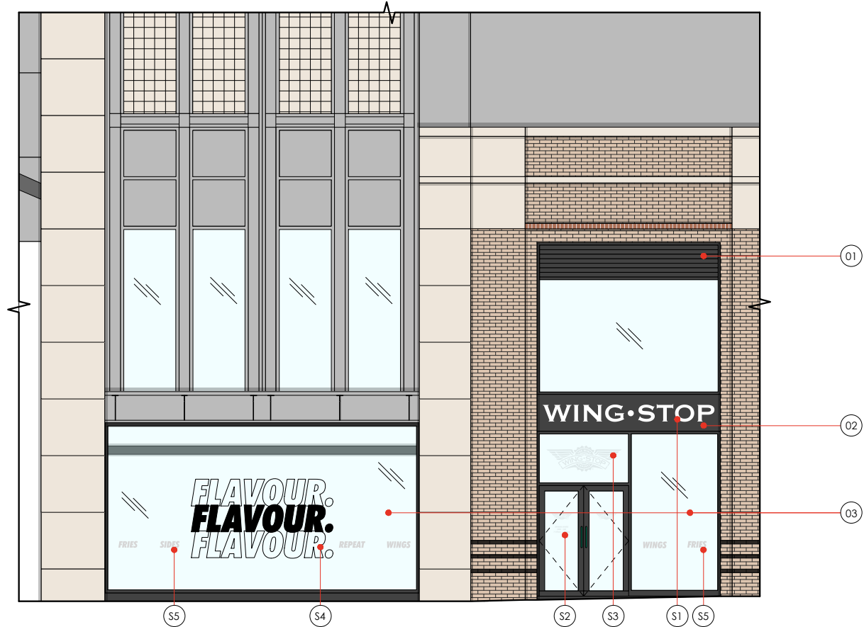
FRONT ELEVATION AA SCALE 1:100