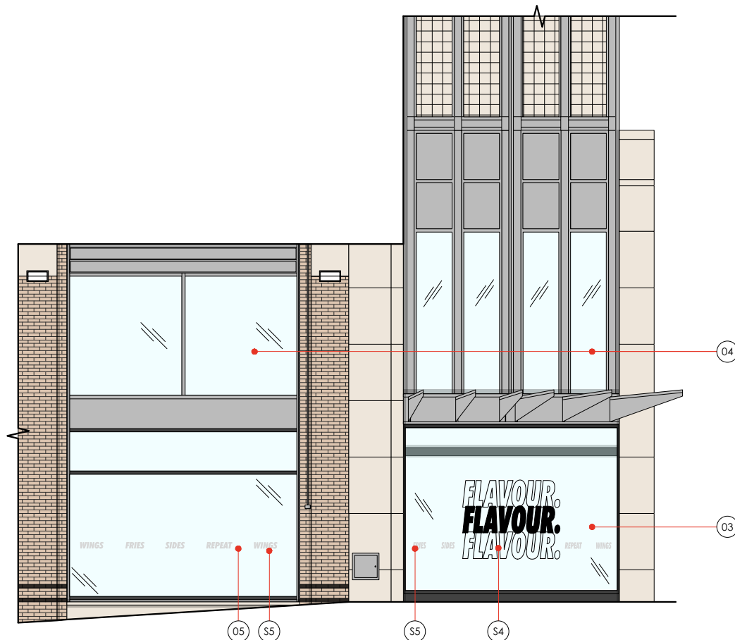
FRONT ELEVATION BB SCALE 1:100